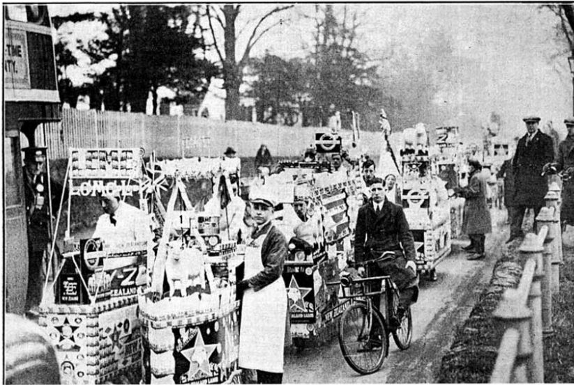
Figure 2. British butchers and their bicycles, decorated in New Zealand lamb marketing material.