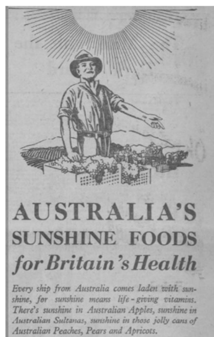
Figure 6. The 'settler'.

However, the life-like settler, at home in a 'better class store', reminds us that the masculine dominions were not only produced in relation to