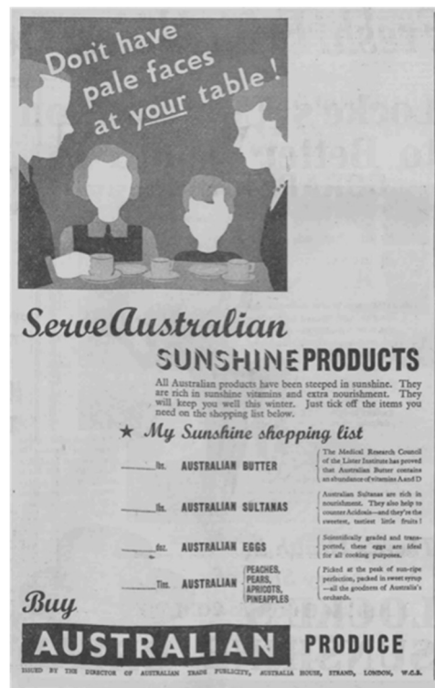
Figure 5. Selling sunshine.

The construction of racial difference was not limited to empire: race was also used to fend off competition from outside it. This was of course made easier by the fact that some of their main rivals - Greek and Turkish dried fruits, Californian canned fruit and Danish butter could be considered 'foreign' even if they were also longstanding and familiar suppliers of food to British consumers. Indeed, in order to capture some of their market share, Australian campaigns capitalized on and constructed the idea of foreignness. Ads frequently and querulously demanded 'Why pay more money for foreign butter'. 91 They also regularly associated Australian food with cleanliness, implying food from other less 'British' sources might be suspect. Australian sultanas, for example, were 'cleanest' because they were 'never touched by hand from the moment they're picked till they reach the shop', a claim undoubtedly intended to inspire unease about the way Greek or Turkish fruit was handled. 92 A similar approach was also used to differentiate white colony from black in EMB advertising: Indian rice was harvested by hand, Australian sultanas were graded and