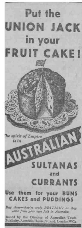
Figure 4. Summoning the spirit of empire.

Similarly, ‘empire buying’ in general was reconstituted as buying Australian. Since 1926, the Empire Marketing Board had been working to stress ‘a vital mutual dependence between the Empire at Home and the Empire overseas’. 82 Australian advertising recast this vague sense of imperial solidarity as a direct dependence between Australian and Britain. Press