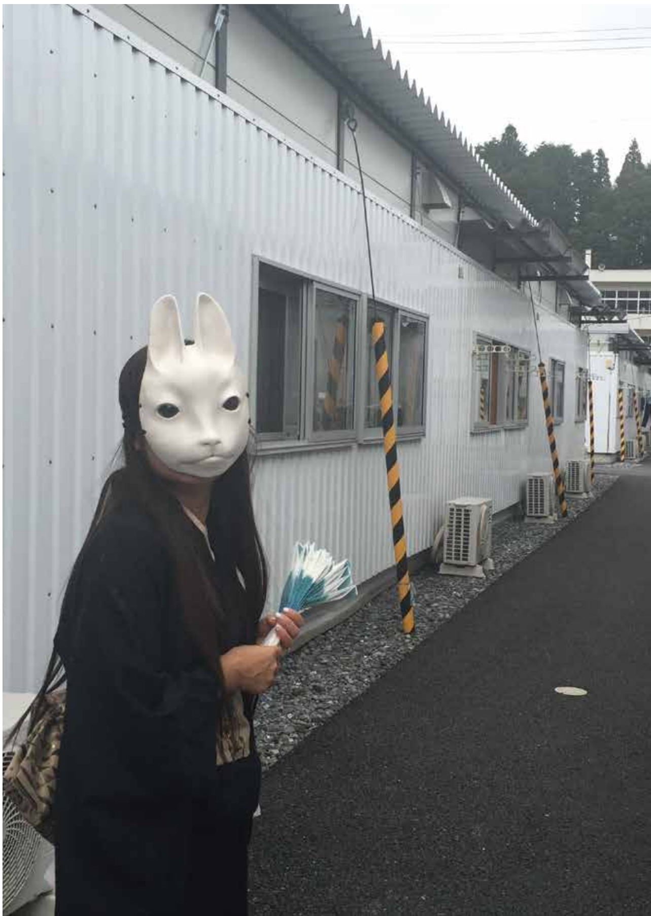
Fig.5 Fox escaping the disaster temporary housing

The participants walked (Fig.6) the evacuation route looking for artists dressed as a fox (Fig.5) in a sense to enjoy the game. Popular activity was a play to use the well water in the middle of the routes. (Fig.7)