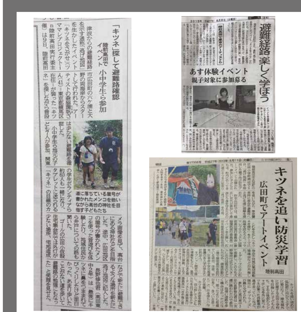
Fig.13 Featured obtained newspaper