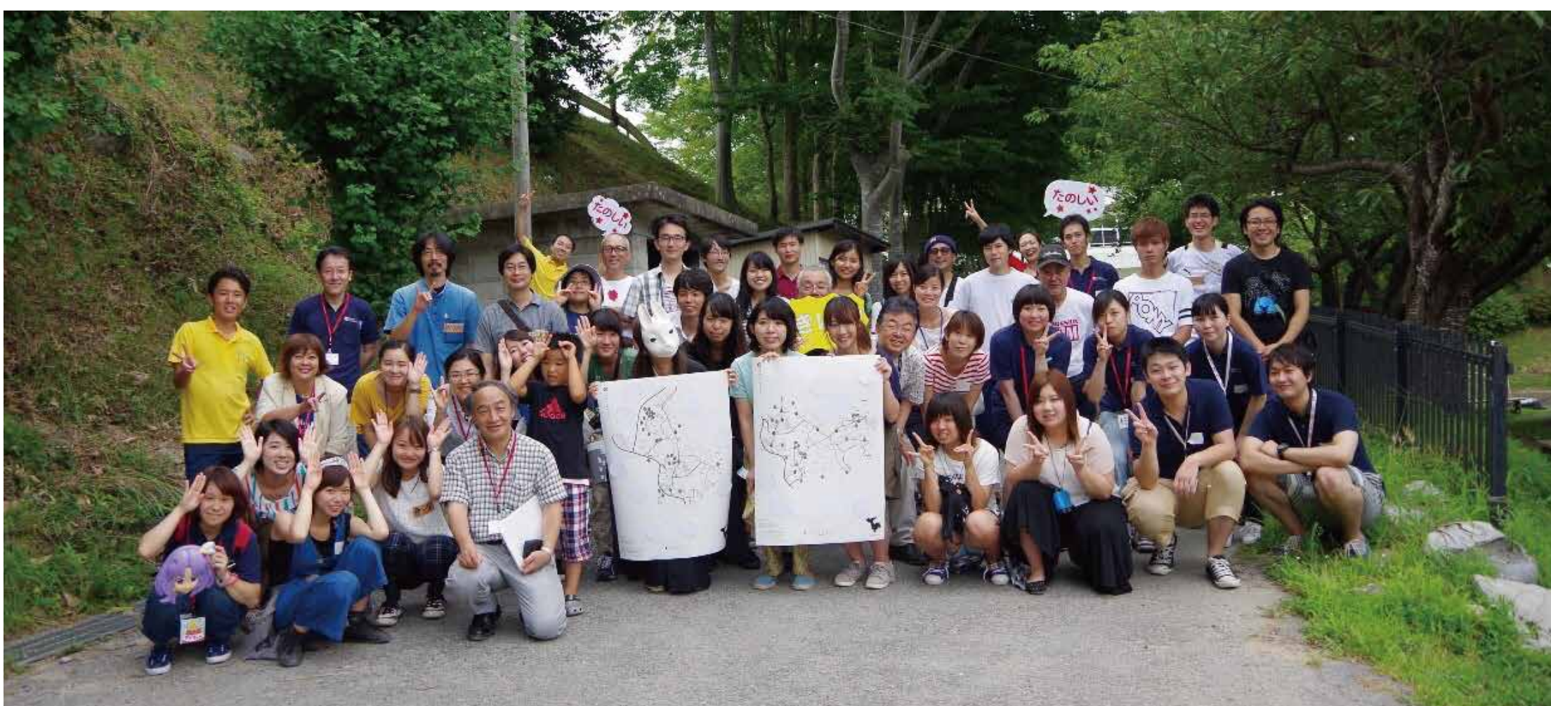
Fig.12 Participants and staff

In the affected areas, there is also a problem that has not yet been in the situation to enjoy the art, the participants was small. However, learn while having fun from the participants, Art is to give a high evaluation that help to disaster prevention and safety. Daily basis overall safety in safe community program to tackle measures that obtained the precedents of in order to taking into account the elements of art meaningful.