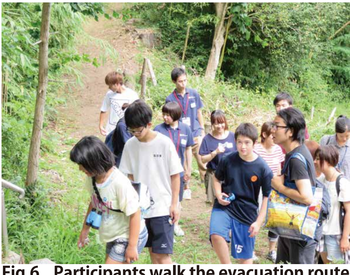
Fig.6 Participants walk the evacuation routes