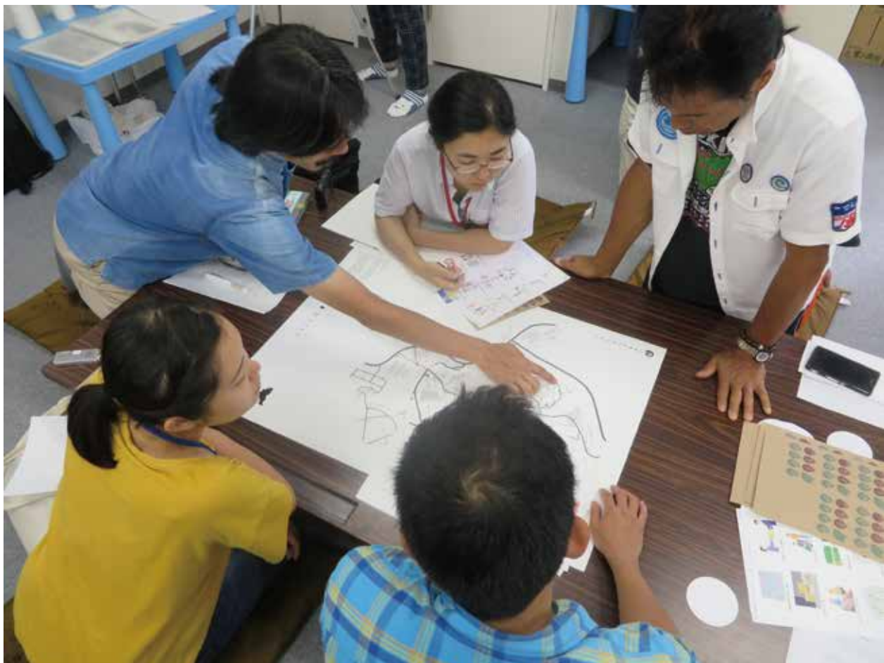
Fig.9 Create a safety map