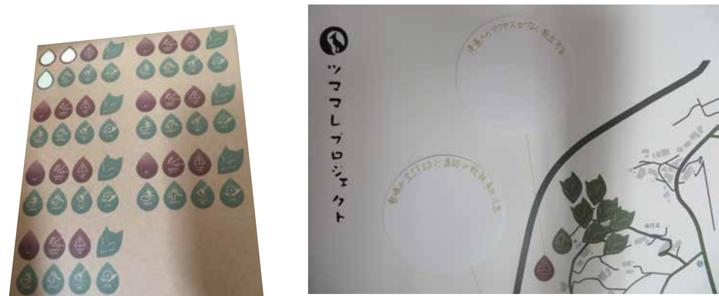
Fig.10, Fig.11 Design of stickers