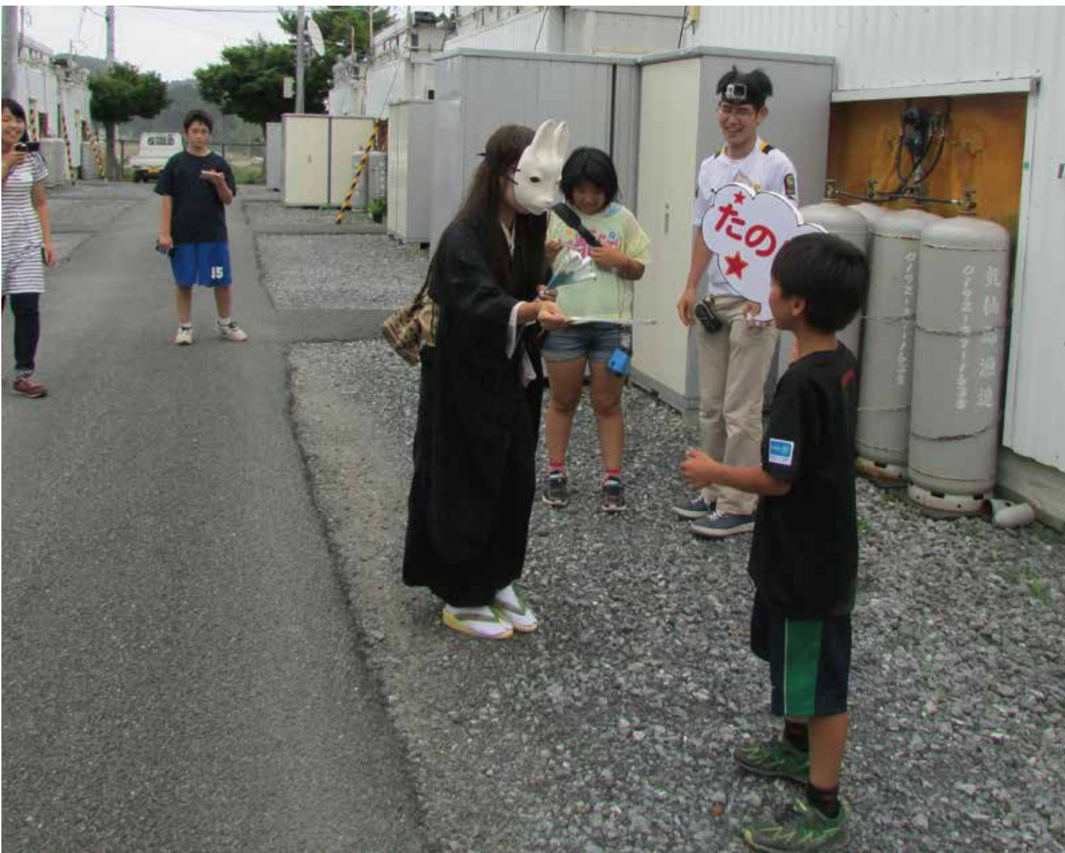
Fig.2 Local children to receive a gift to find a fox