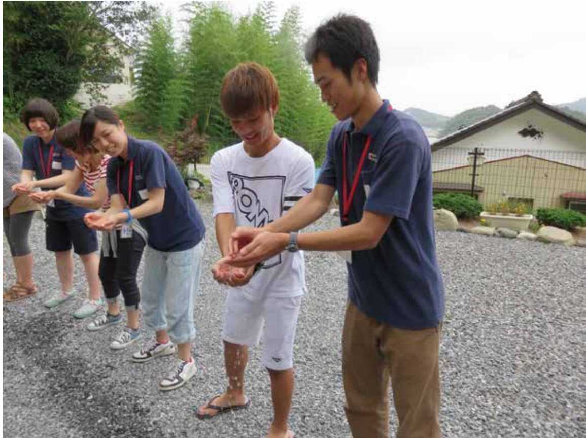
Fig.7 Carry well water games