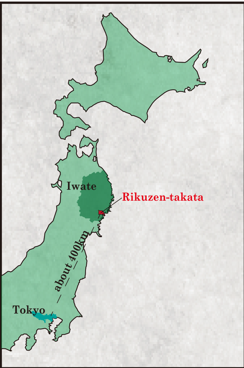
Fig.1 Located Rikuzentakata

We practiced two types of Art program that resident' s volunteers created last year, the evacuation map from tsunami. About 70 people participated in the 3-hour program divided into 2 courses 3 groups, and they' re answered the questionnaire after the activity.