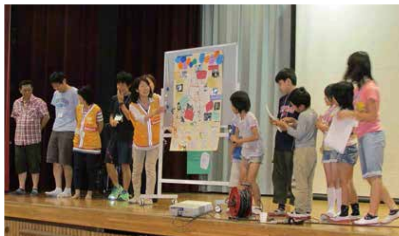
Students presented their Map.

We supported the workshop promoted by Shimizu elementary school (ISS) in Atsugi-City. In the workshop, students and their parents made a map through the safety inspection around the school area. This activity aimed to help them understand their area and find current problems.