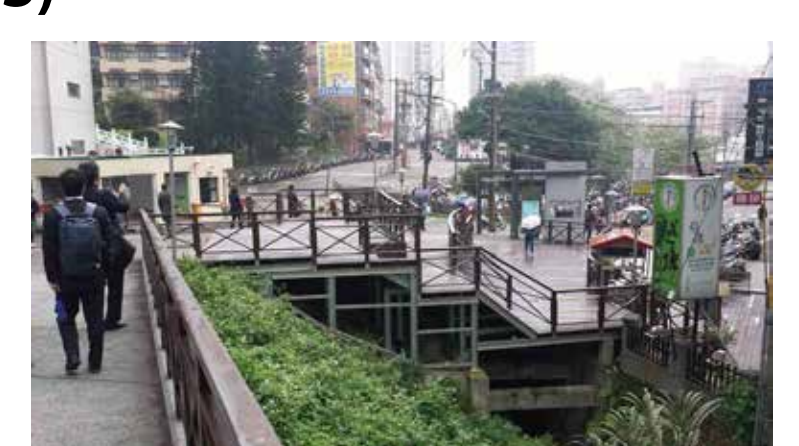
They refurbished the campus area.

Tamkang University is one of the best ISSs not only in Taiwan but also in the world. They designed the campus for people to use safely and healthily, especially for the disabled persons. They also have a consulting room for students, to improve their life in various ways.