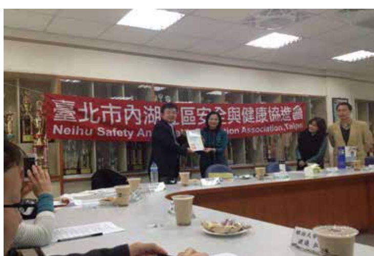
Meeting with teachers and SC people.

Sanmin Junior High School is an ISS in the Neihu SC district. They have beautiful nature and the mountains behind the school. They use the nature for making the school environment safe. Both teachers and students were enjoying the ISS activities.