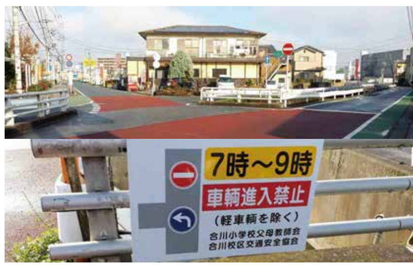
30km/h or under, No Entry 7-9 AM

"Zone 30" is the area where vehicles have to speed down under 30km/h. Aikawa elementary school in Kurume-City area has set up a "Zone 30". It secures students from having traffic accidents on the way to the school.