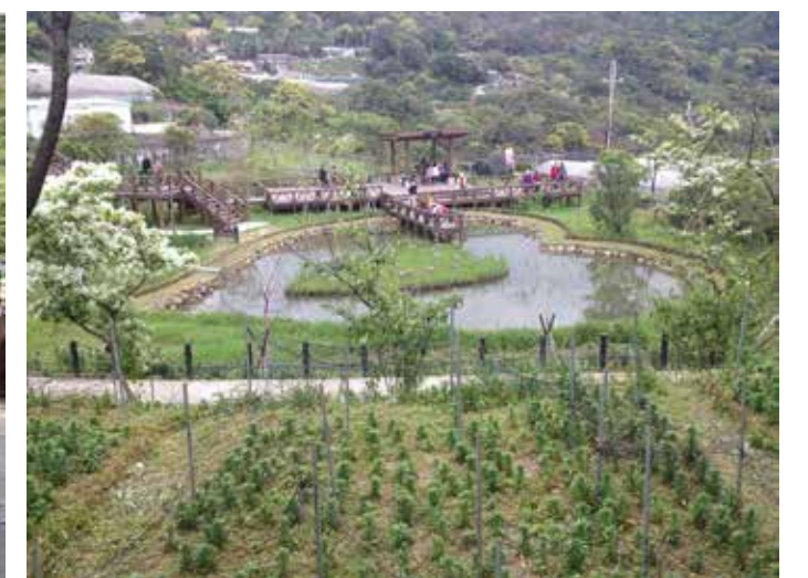
The Heart shaped pond