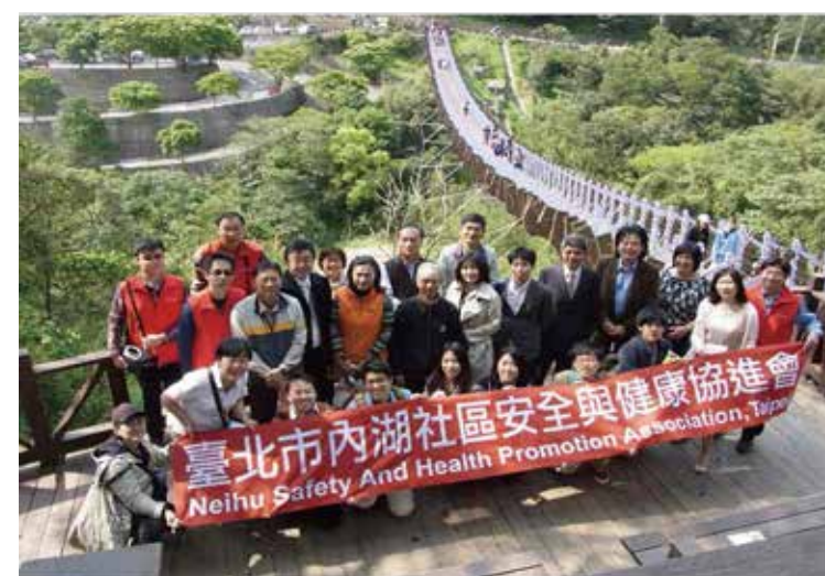
People greeted us at Baishihu.