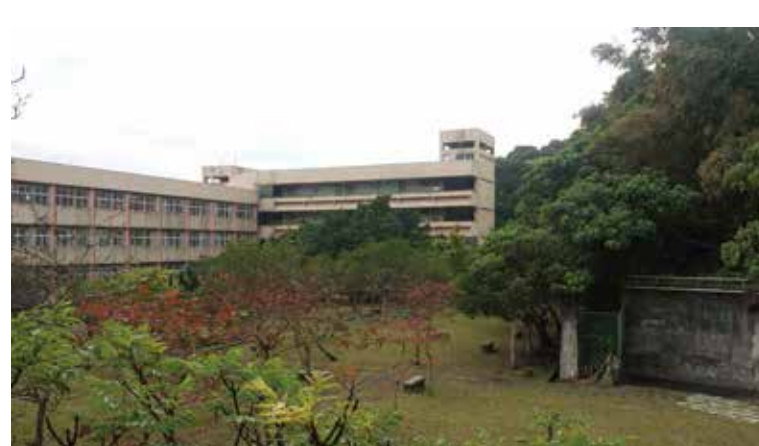
They have rich natural environment around the school.