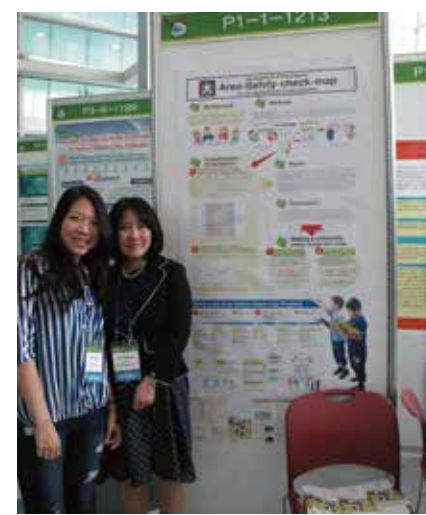
The poster session

We participated in the 7th Asian Conference on SC in Busan, and presented about a comprehensive approach for protecting children from crime, including projects of Health, Community, Internet etc. This idea of project integration is new in Asia, so it collected a lot of attention.