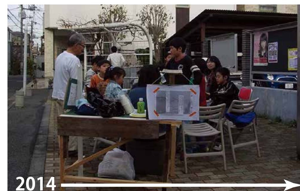
Jin-Bato Game in Hato-no-Machi (Town of Pigeons)(2014)

Art events in Mukojima started around 2000. Once a year, many artists were invited and used the whole town for the events, but those events didn't continue. In 2009, an NPO-AMS (Association of Mukojima Studies), TMG (Tokyo Metropolitan Government) and Tokyo Metropolitan Foundation for History and Culture organized the art project <Bokuto Machimise> and continued till 2013.