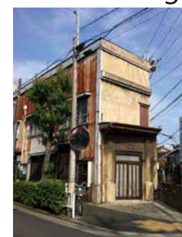
Exterior of a shared-housing, Bunka-kaikan