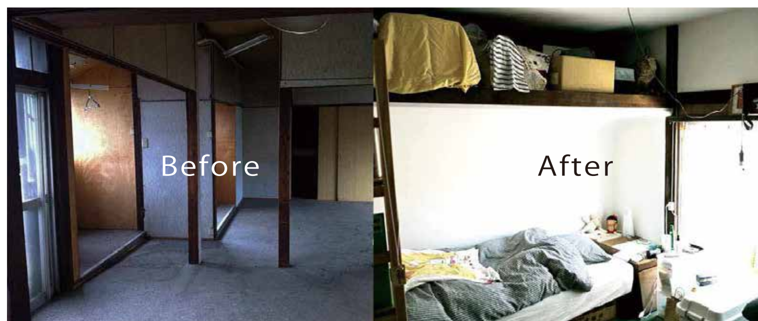
before and after : renovation of vacant house

Often young artists renovate vacant houses for their activities. They prefer the atmosphere of old private house, and the earthen and wide entrance space of the small factory is suited for their production work. They make human network with the residents through art events, and negotiate with the landlords to rent. Reuse of vacant houses prevents deterioration, and with the low rent it encourages young people to move into the community.