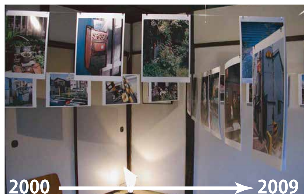
Mukojima Art Events in Autumn(2002)