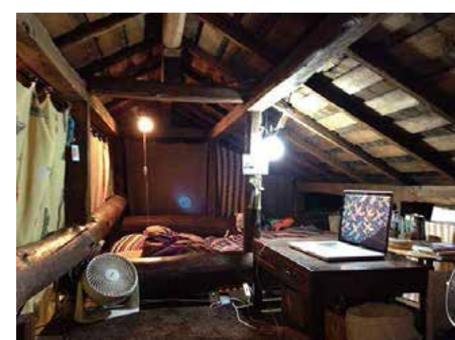
Interior of a shared-housing, Bunka-kaikan