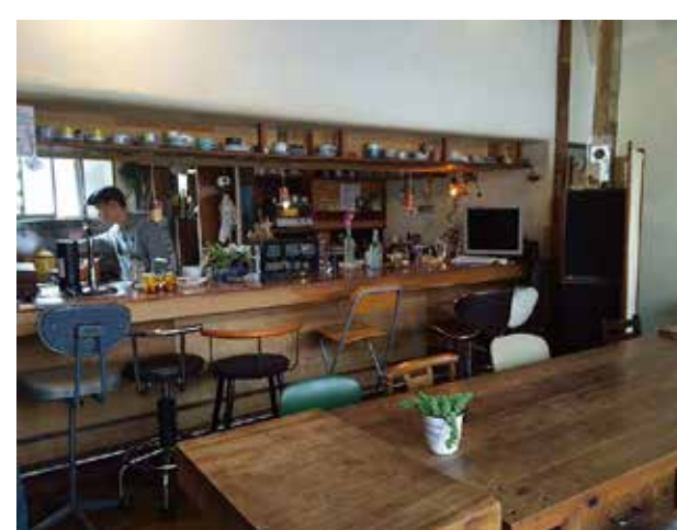
Interior of a cafe, Bunkan