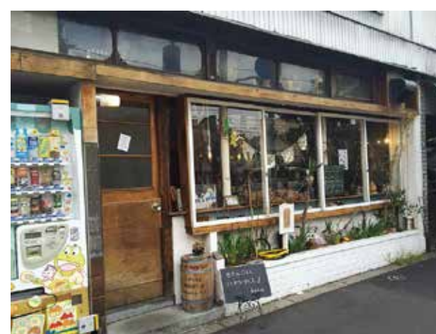
Exterior of a cafe, Bunkan