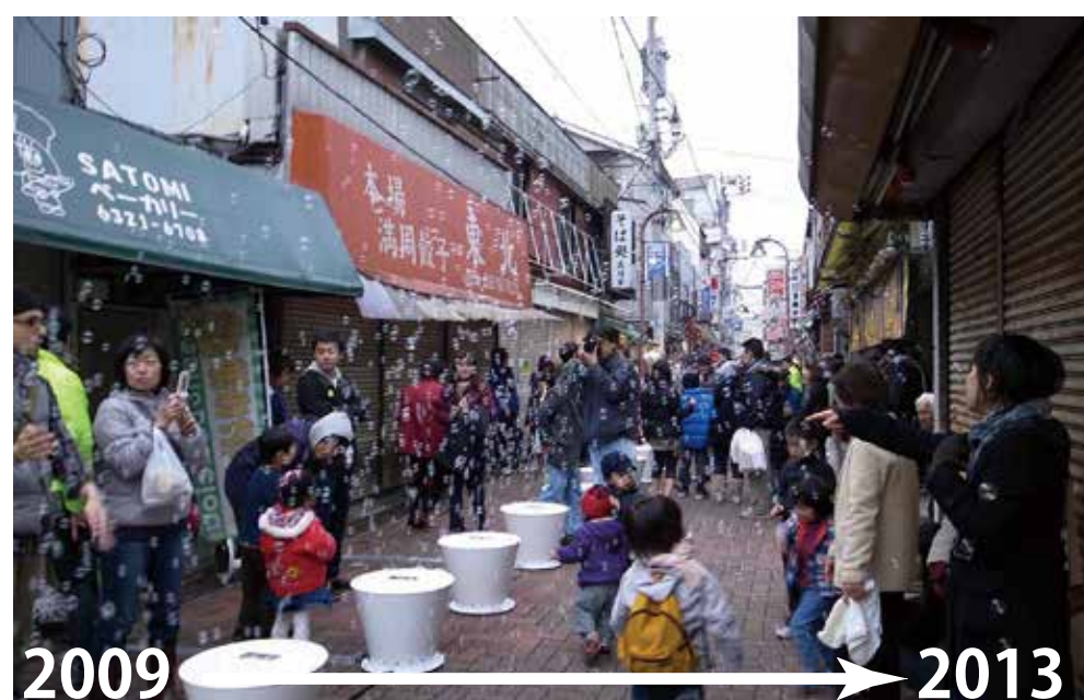
<Bokuto Machimise>Art Events(2009)