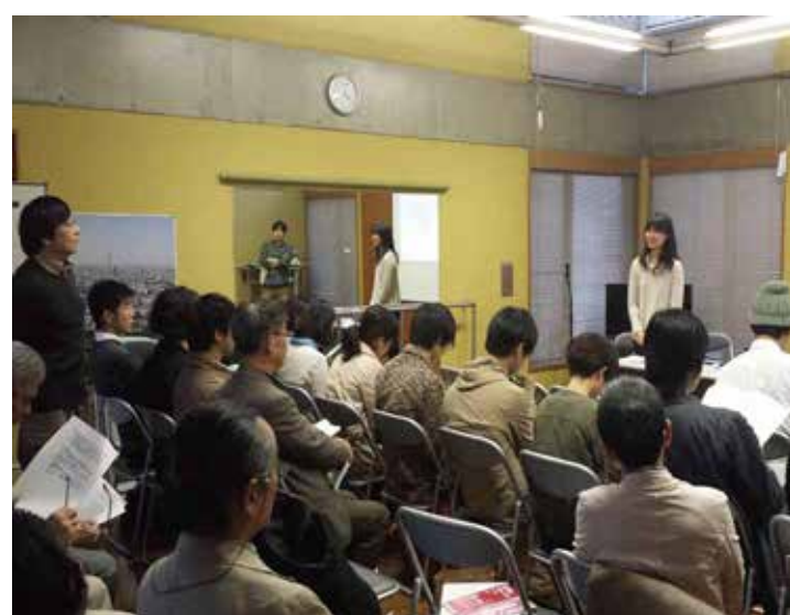
At communication salons and events titled "Mukojima Studies", students do research presentations on Mukojima, or report on activities of AMS.