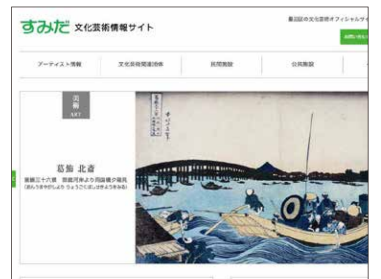
On website, AMS provide information on gallery, events and artists active in Sumida Ward.

Association of Mukojima Studies(=AMS) aims at review and utilization of local resources, and revitalization of the area. It is an NPO, carrying out activities rooted in the area, such as research and community development. It is also actively engaged in art events and communications with other areas.