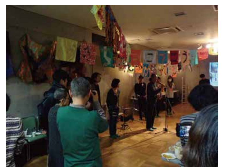
The art event "Bokuto Machimise" was operated by members of AMS until 2013.