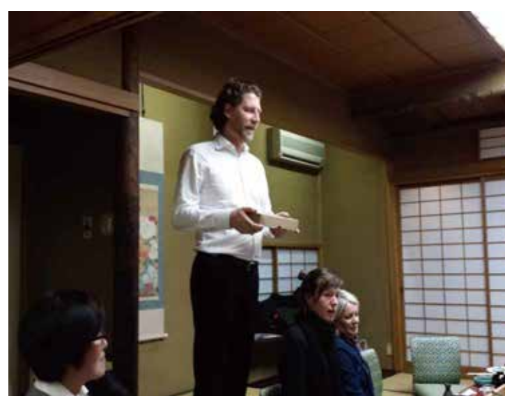
AMS has kept communication with Hamburg over 25 years.