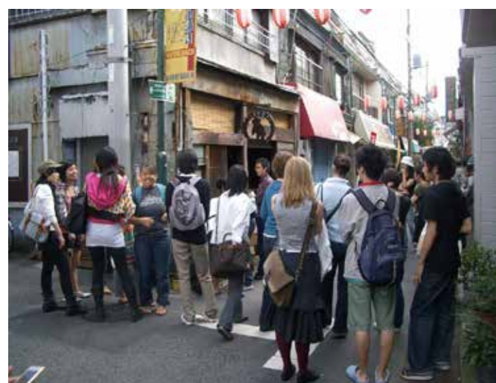
AMS supports the project to open the vacant shops and attract potential tenants, along the "Hatonomachi Shopping Street".