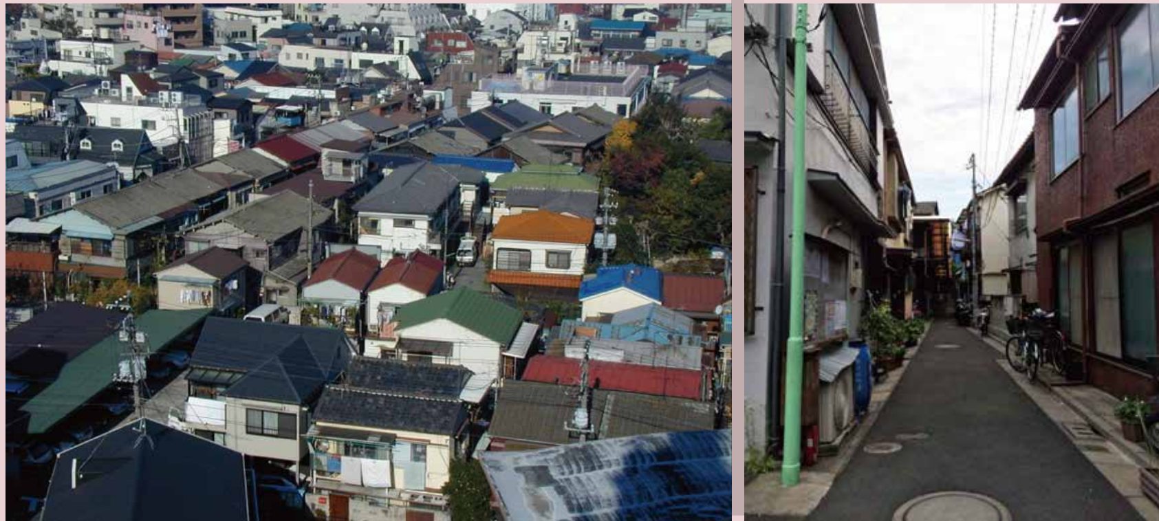
There are many narrow alleys and the dead ends

After the Great Kanto Earthquake in 1923, many wooden row houses were densely built for the refugees, escaped from the surrounding areas. The following rapid growth of population caused to form even denser and chaotic residential district, where narrow farmland paths simply became urban alleys and infrastructure undeveloped. This area was not burnt by air bombing in the WWII, and the unique townscape with alleys have remained up to today.