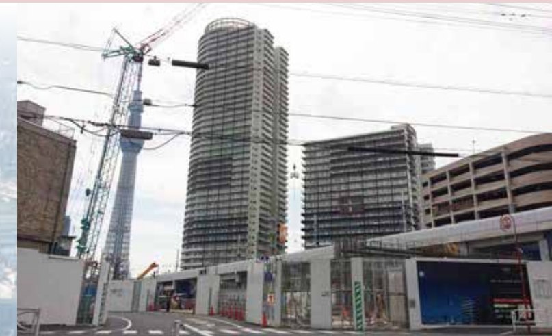
Large scale redevelopment taking over local community

High density wooden houses are facing the problem of crime and disaster prevention reflected by vacant houses and decrepit houses, antiseismic reinforcement. To solve these problems and then create a safe, comfortable society, various methods and techniques are carried out: strengthening community through Art events, and using the existing housing stock through renovation.