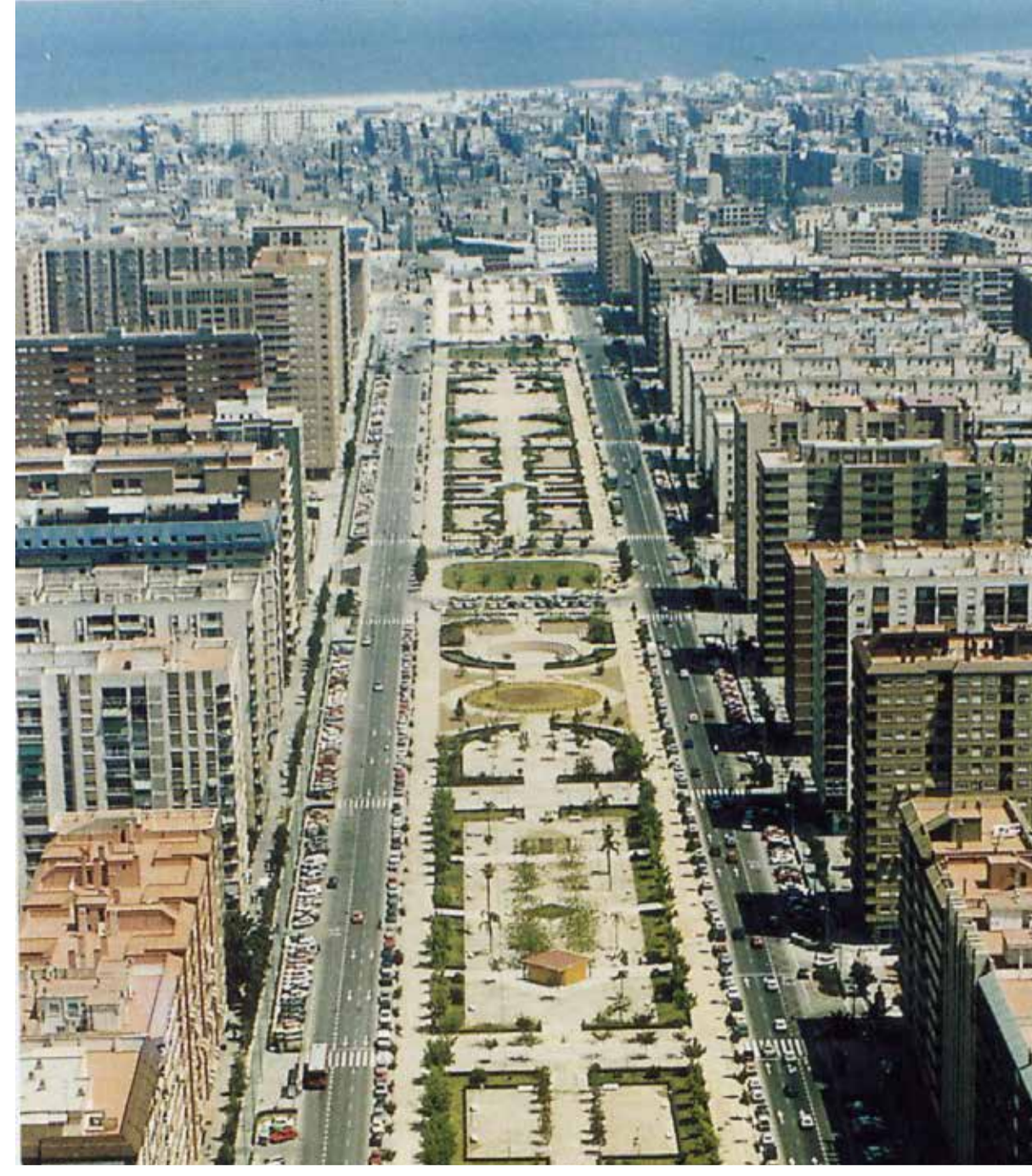
Planning road approaching to Cabanyal

Embroidery project is one of the activities called "Portes-Oberutesu" began in the Cabanyal area, Valencia, Spain, 17 years ago. The City of Valencia tried to carry out the construction plan of the highway that would divided the Cabanyal, including the landscape preservation district, into two. Residents who were against the plan stood up and started the art event. Art events by the residents have been carried out to preserve the historic buildings such as the fish market, human scale of the street spaces, culture and history. Embroidery projects have begun to be carried out in various areas in the world.