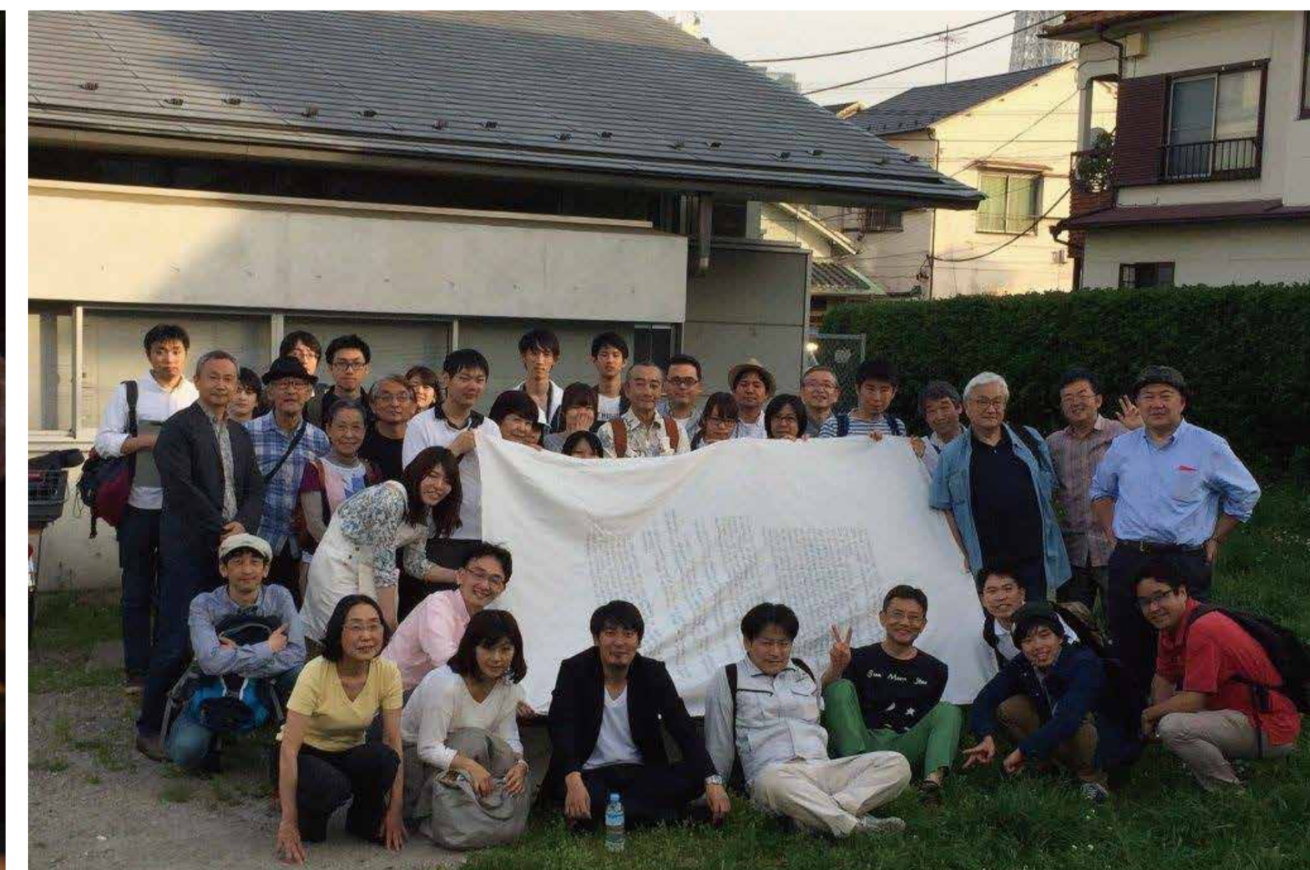
With the completed embroidery