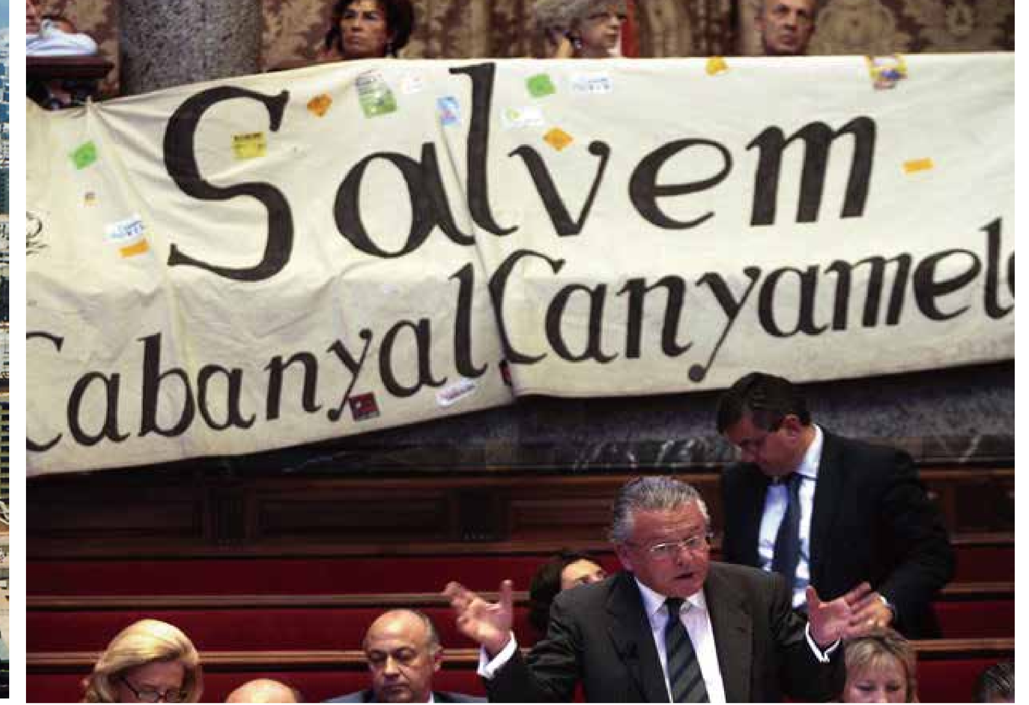
People who claim to preserve the Cabanyal