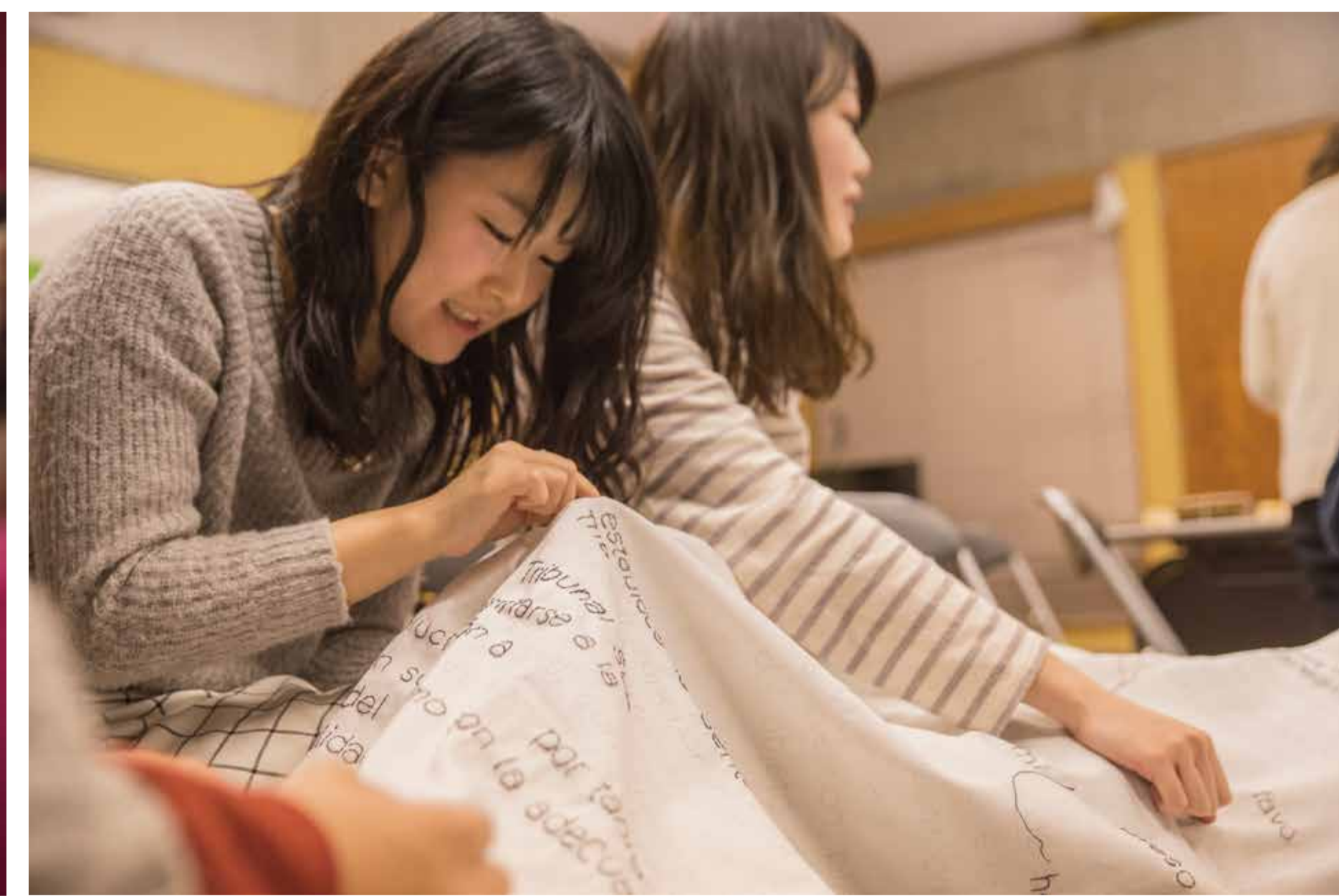
A scene of embroidery making in Mukojima