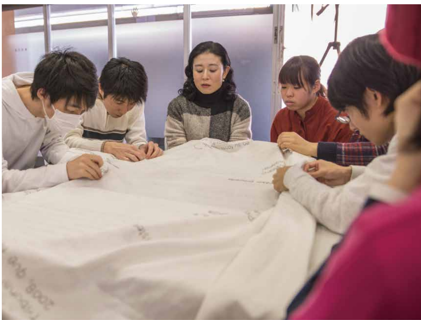
A scene of embroidery making in Mukojima

On December 29, 2015, an embroidery project in Ottensen was carried out upon the request by Cavanyal. On February 28, 2016, an embroidery project in Mukoujima was carried out at the Ichiterakototoi Meetinghouse. People worked on embroidery, with the participants from the NPO Mukojima Society. Later it was completed by the 33 participants, who mainly are the member of this laboratory. "Participants commented that "I got the sense of accomplishment.", "It was good to work with people and created a whole thing", "It was fun talking working", and "I sympathize the project by knowing more about the project"."