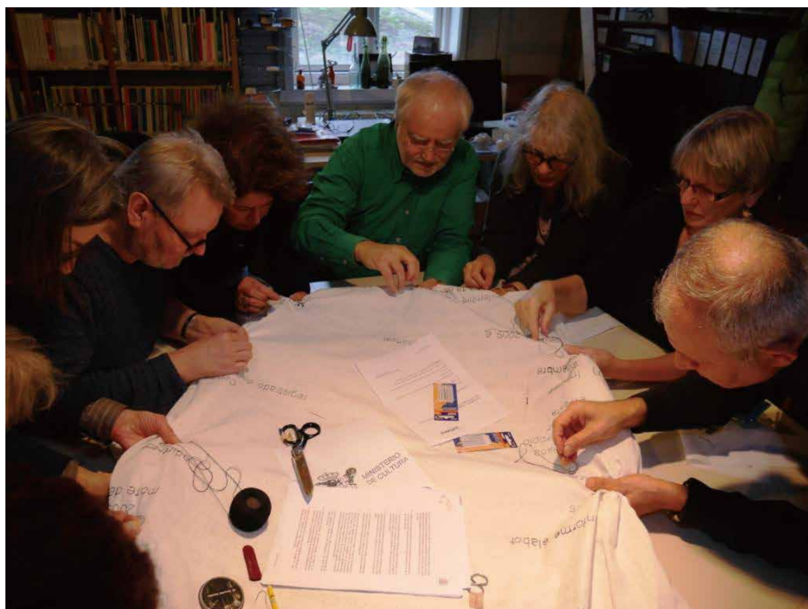
A scene of embroidery making in Ottensen