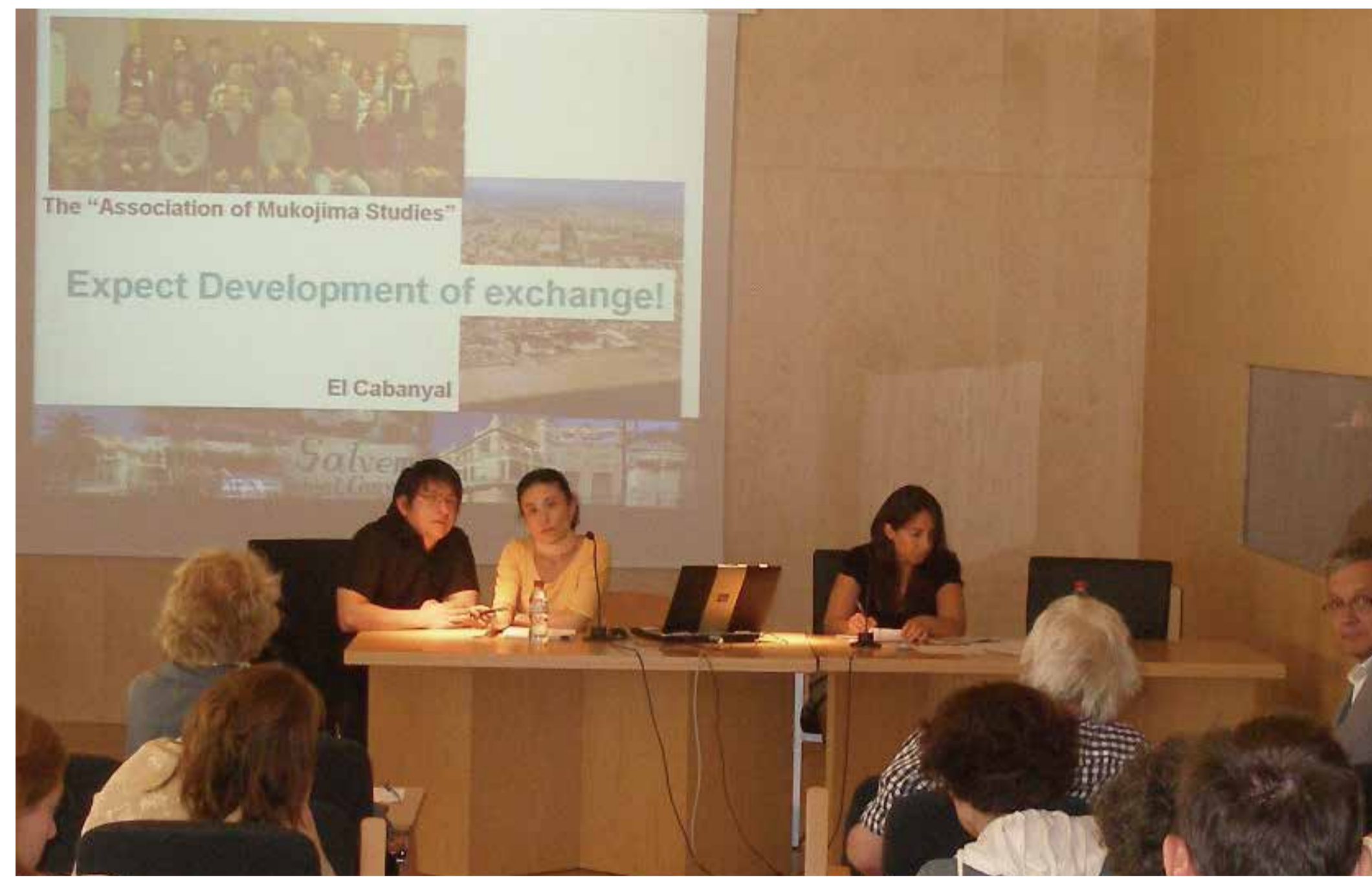
Announcement by The Mukojima Society

Vacant lots and houses have increased in Cabanyal and has become a problem. The architecture and cityscape of Cabanyal keep unique history and culture, and the succession and restoration were also important issues. International conference was held in cooperation with the NPO (not for profit organization) of Ottensen and the Mukojima Society in August 2011. It was followed by an international student workshop, where 23 from this laboratory of Meiji University from Japan, 11 from Hamburg Hafen University, total of 74 participated from 8 countries.