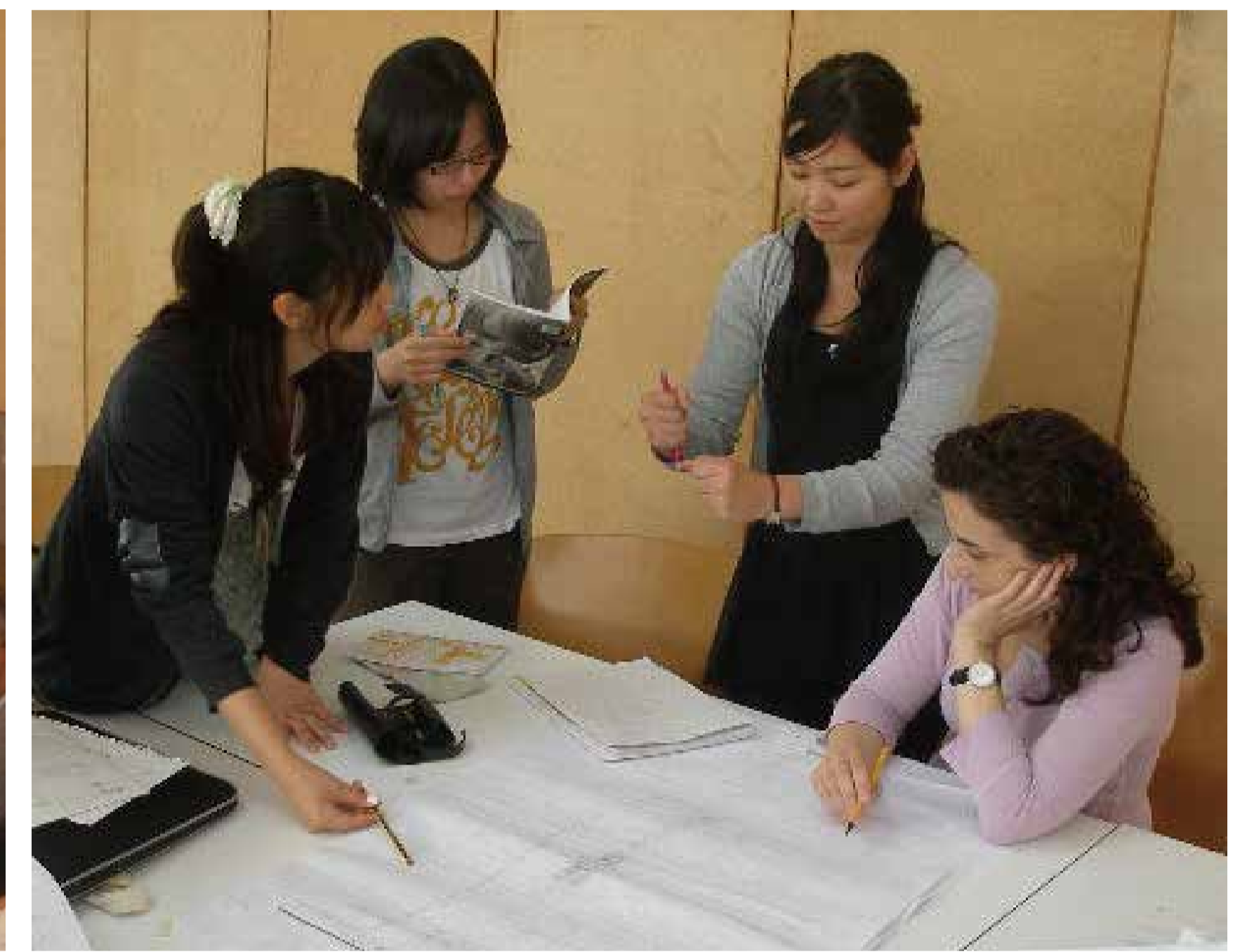
A workshop in Valencia