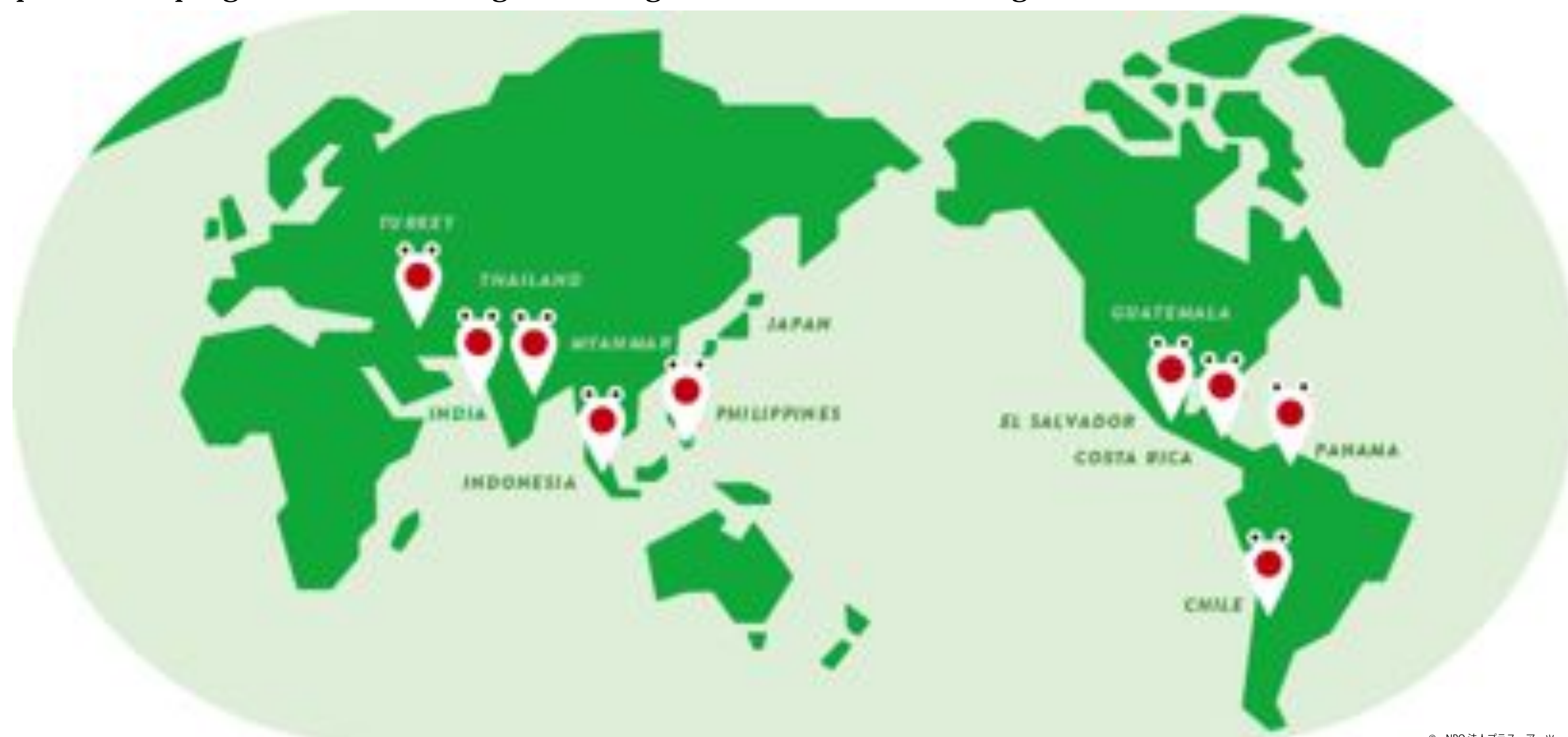
Countries that have held the “IZA ! KAERU CARAVAN !”

The “IZA! Kaeru Caravan!” is extending its activities in other countries while understanding the regional characteristics and proposing disaster prevention activities suitable to the region. A tool to use in disaster prevention programs are also using something familiar to life in each region.