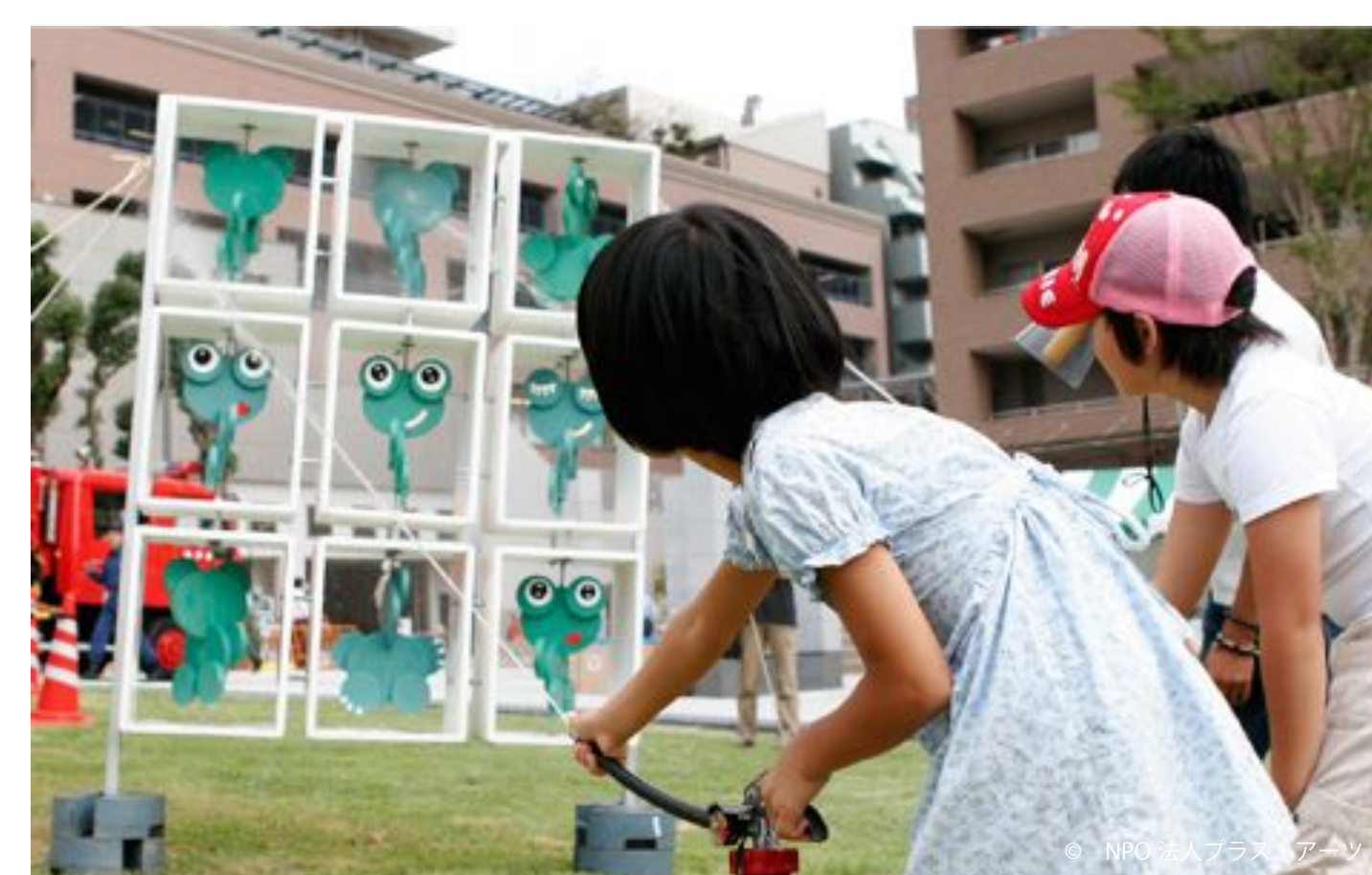
EXTINGUISH THE FIRE!

This program started in Kobe in 2005 and now is spreading to many areas. It can be arranged according to the local characters.