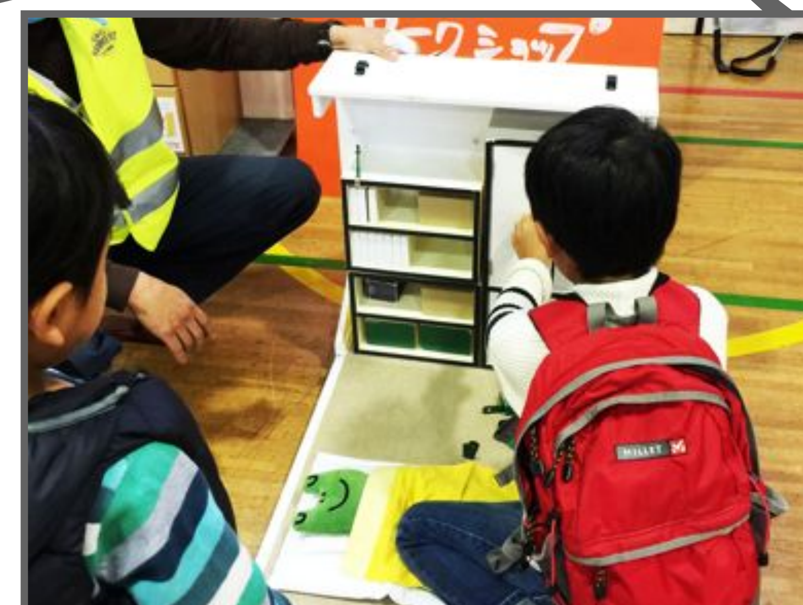
Workshop to "prevent furniture to fall over"