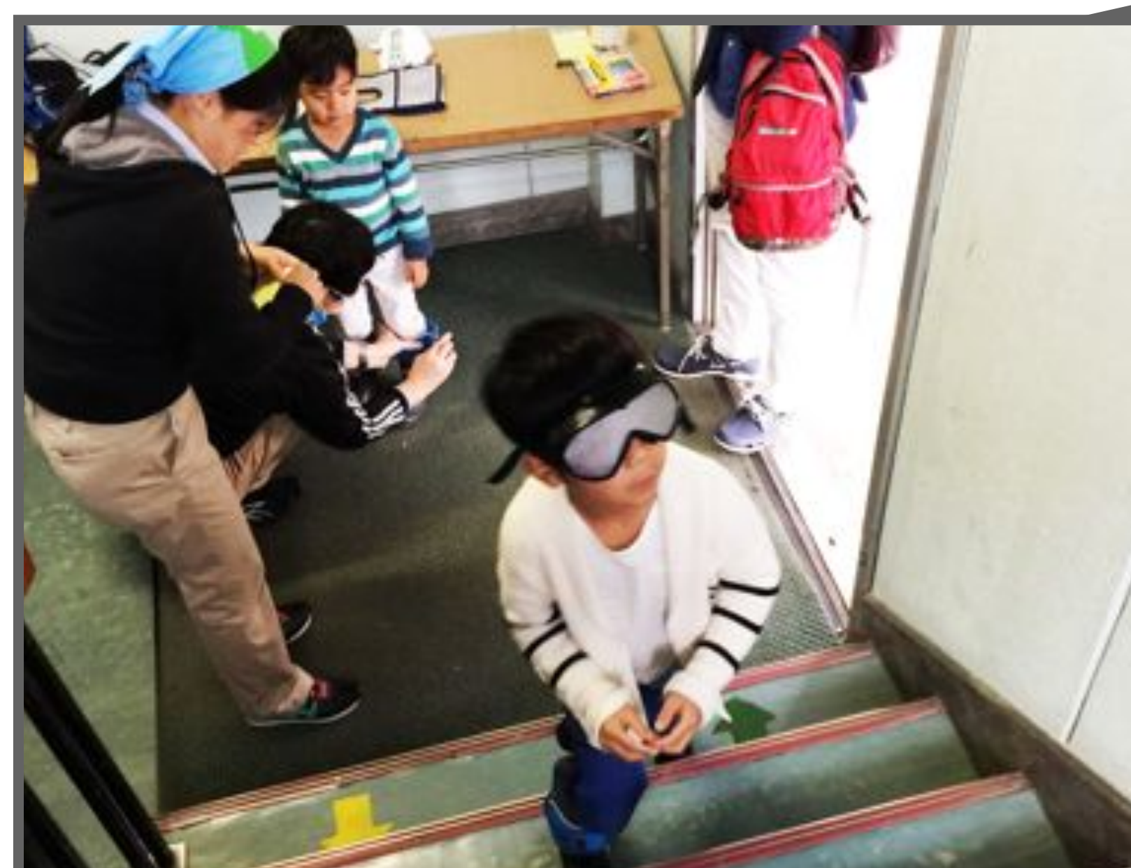
"Become a Senior and Experience Flood" program