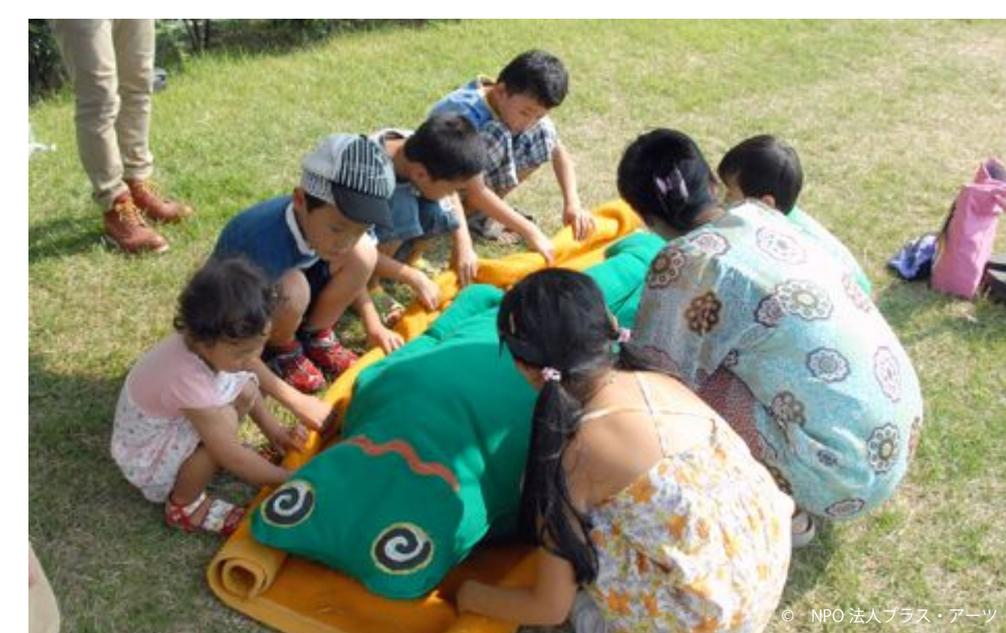
SAVE THE PEOPLE!