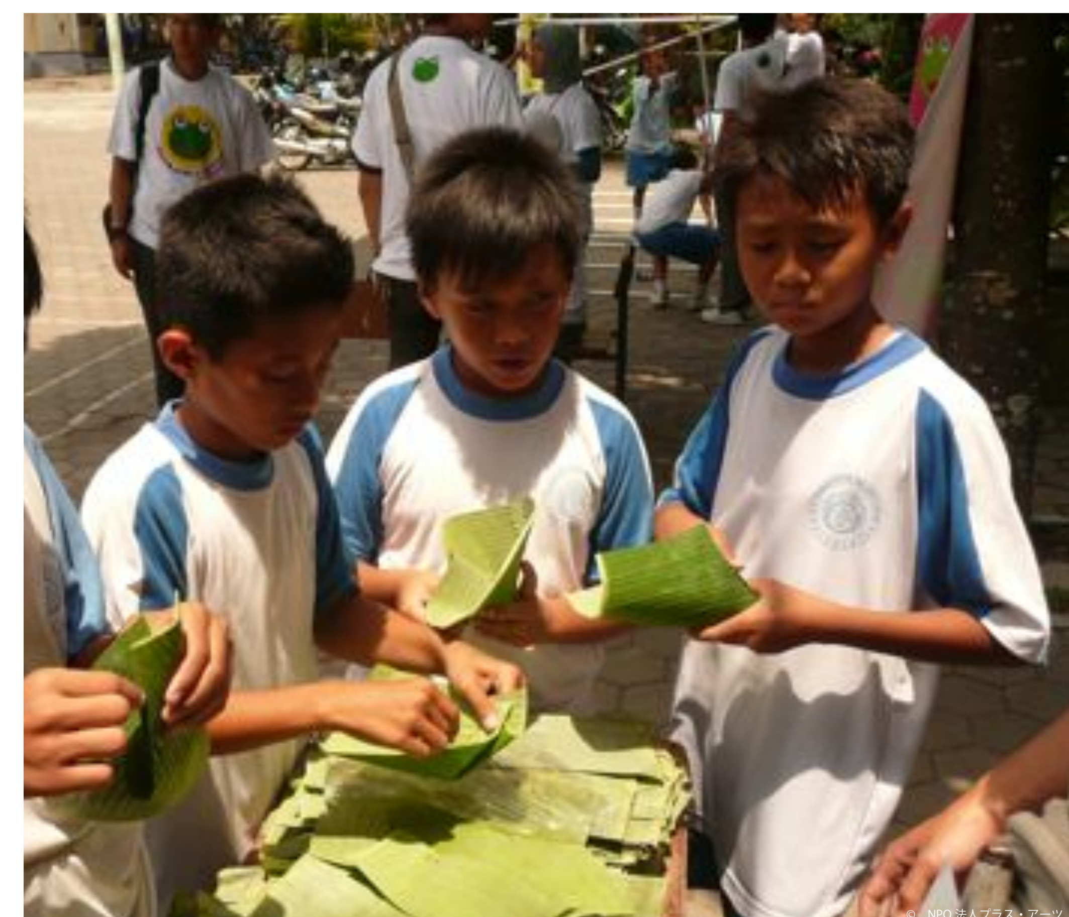
Making of the dishes using banana's leaf / Indonesia

For example, frog motif, because it has apply a "return" to the frog in Japan. However, the motif of another animal is abroad, has began to penetrate the region.