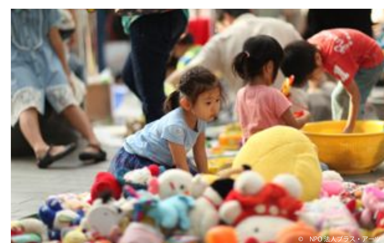
TOY EXCHANGE BAZAAR