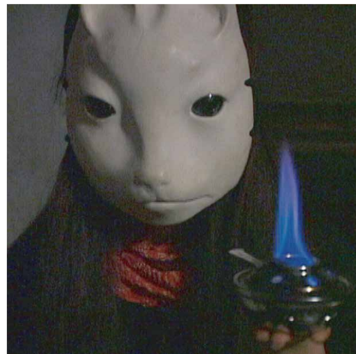
3 Boil rainwater