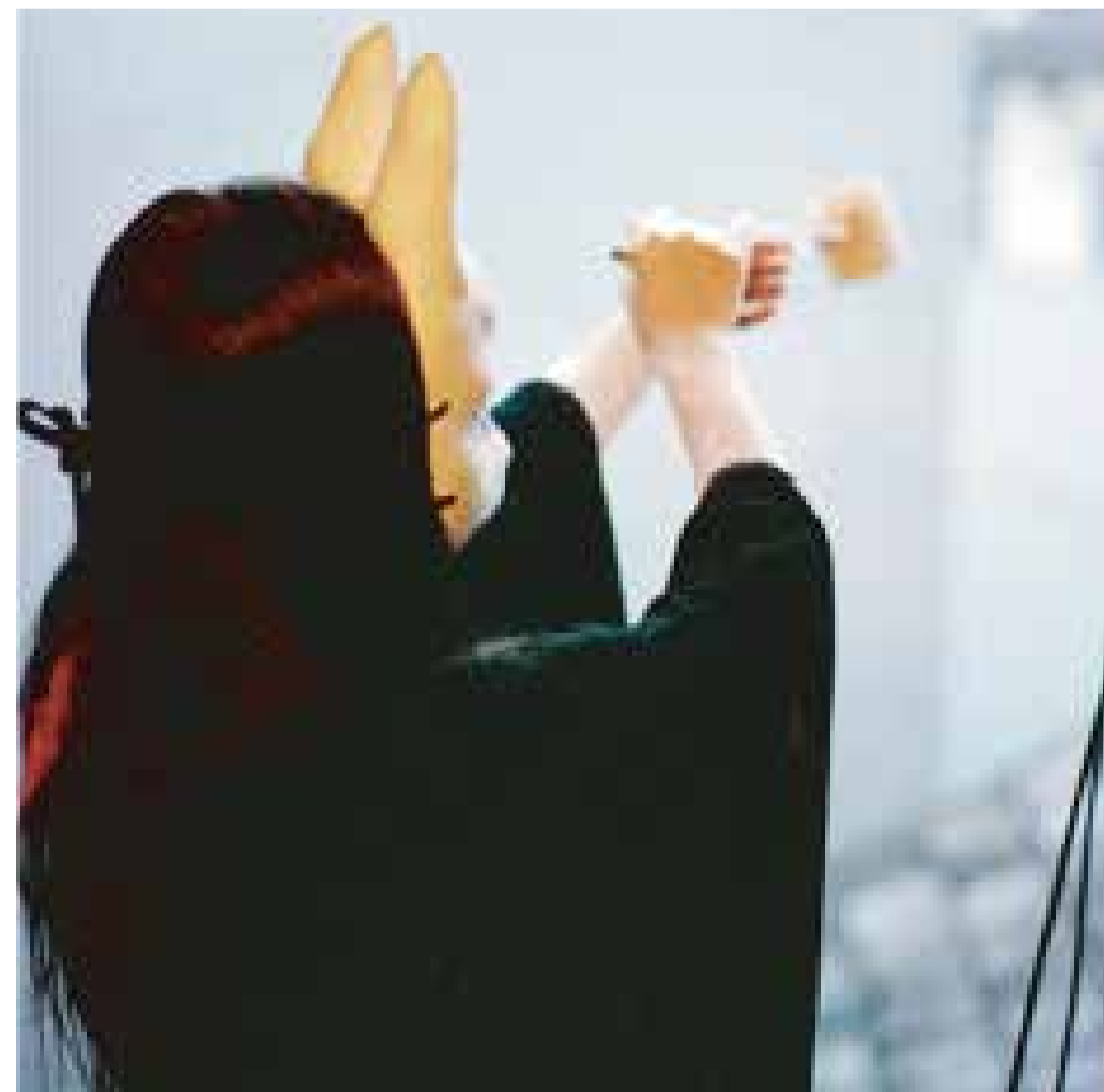
1 Tradition rainwater