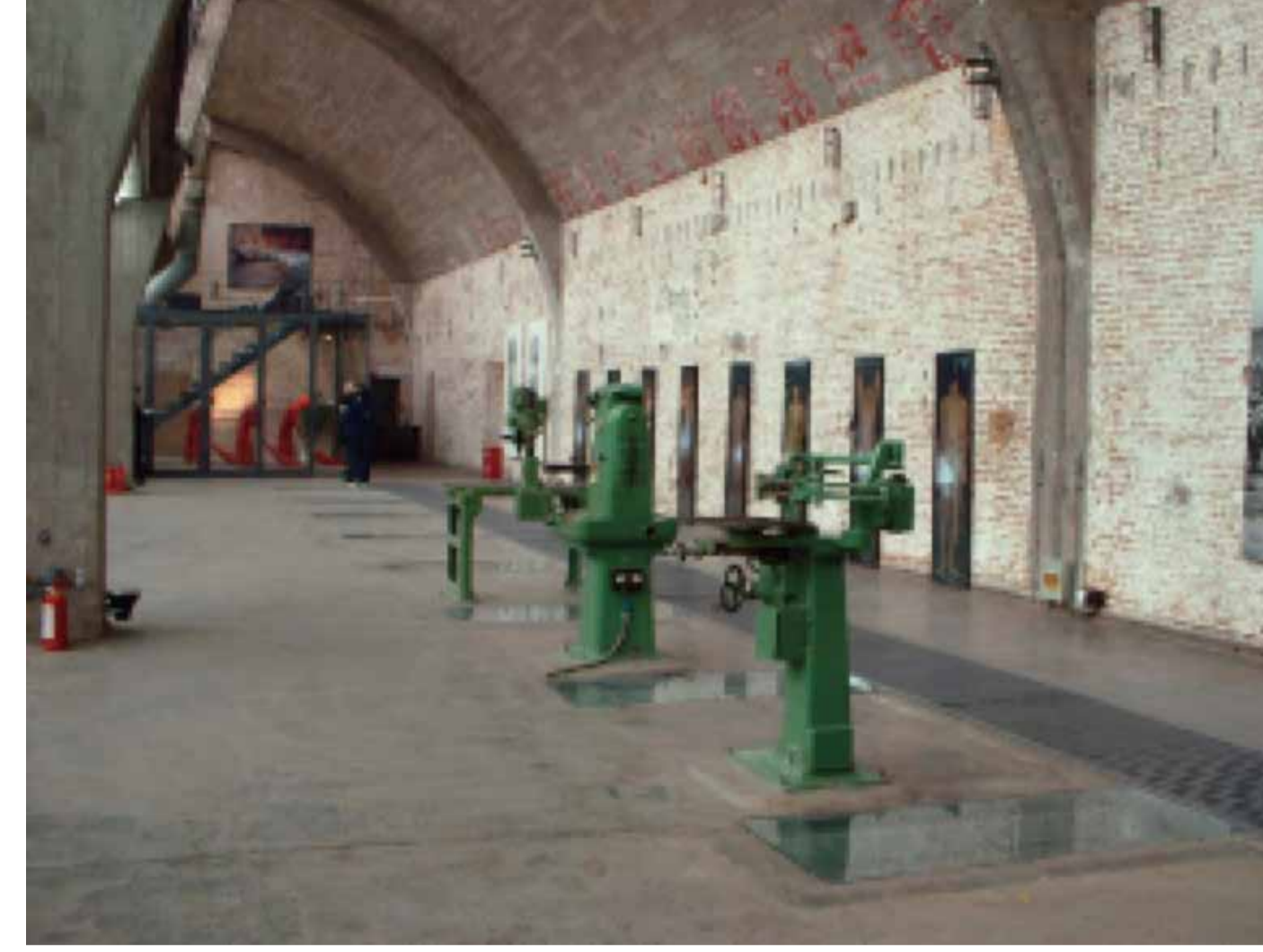
Tsumamare in Beijing