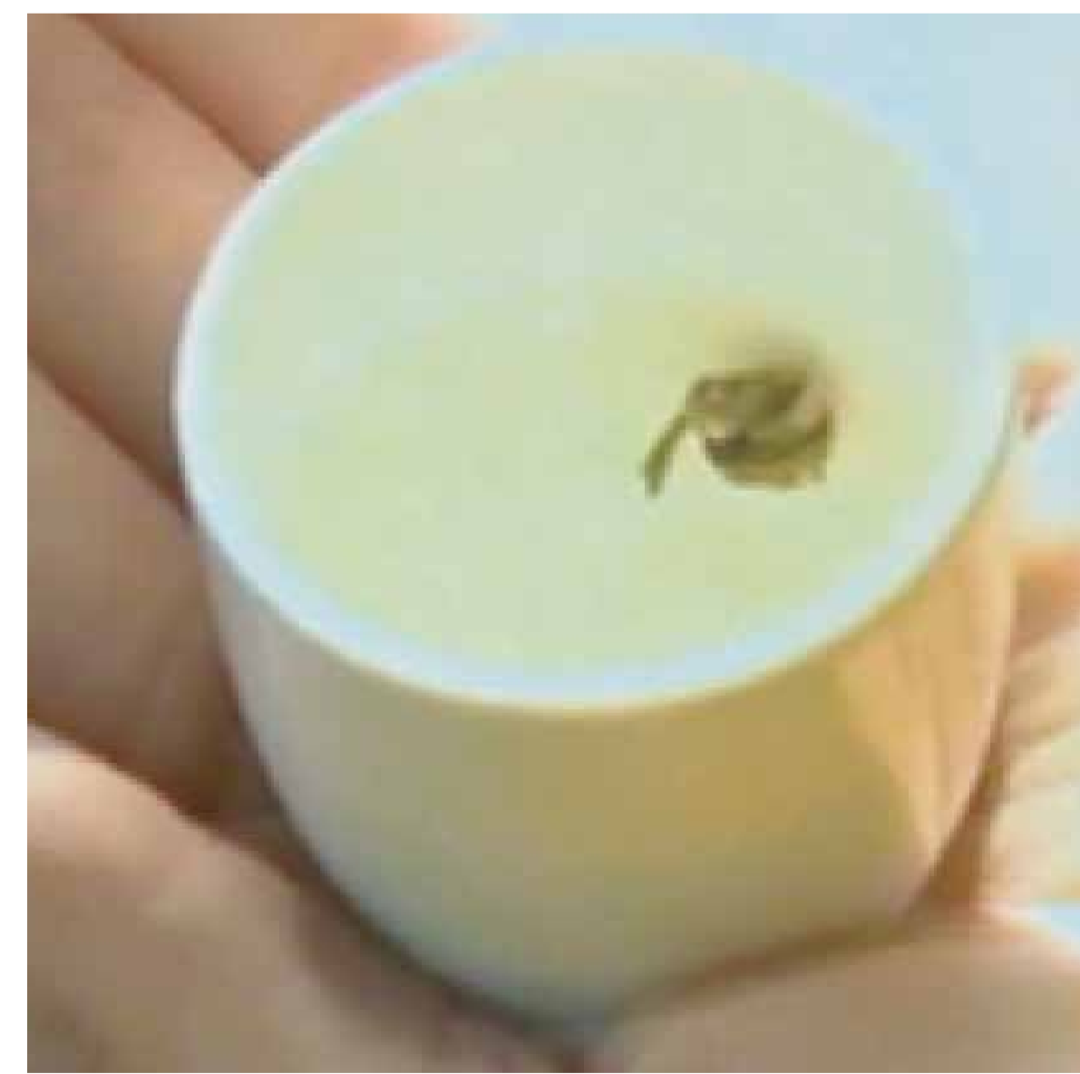
4 To tea put the tea leaves