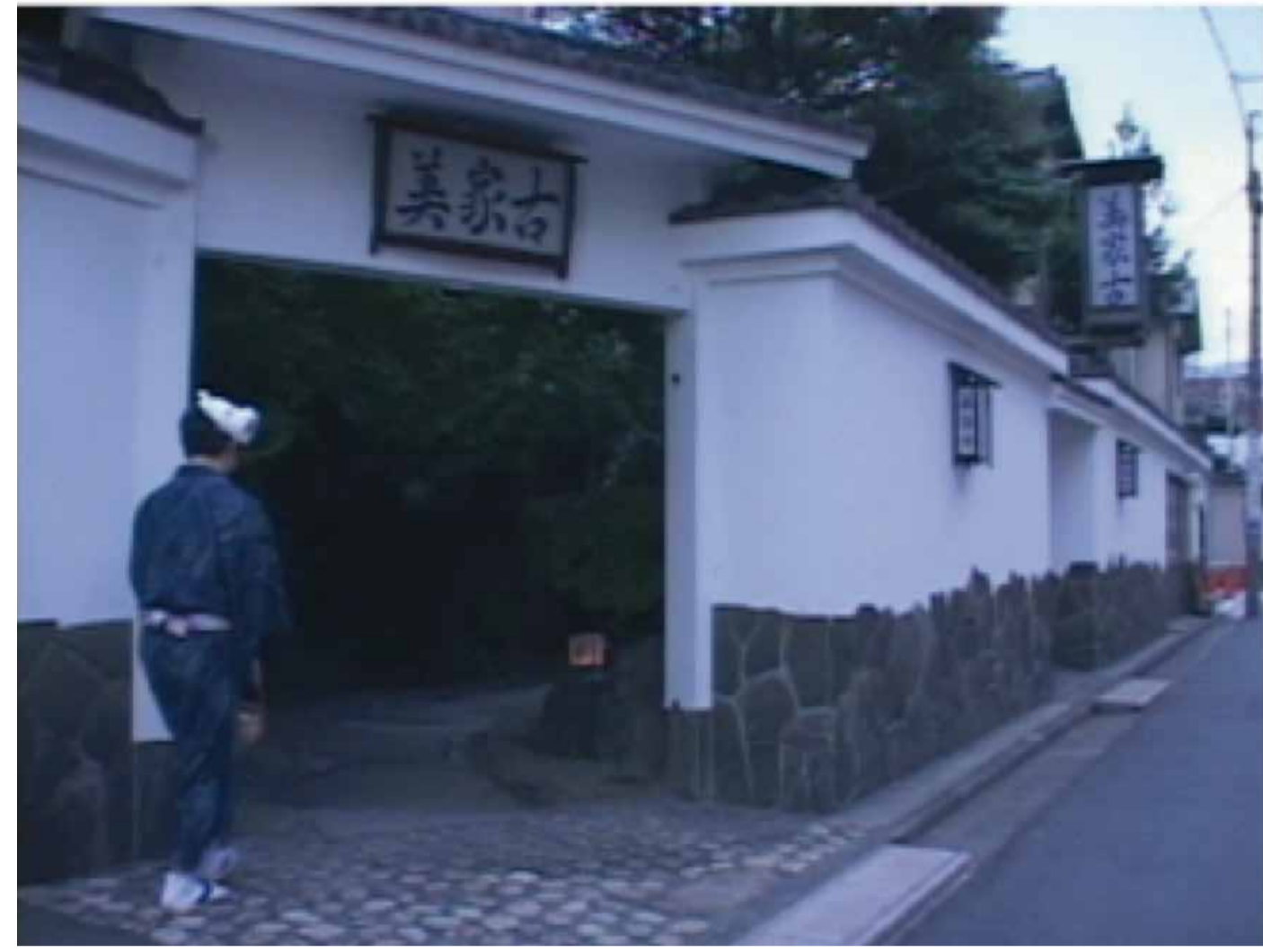
Tsumamare in Mukojima restaurant