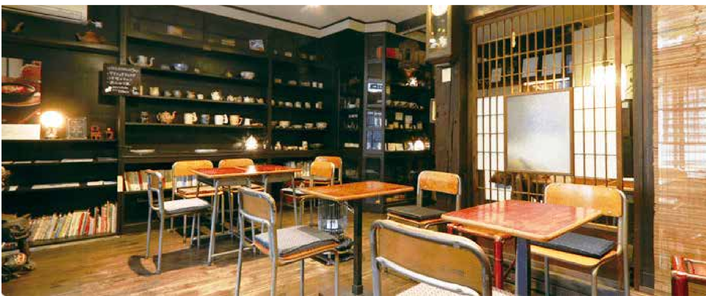
The interior of the Koguma Cafe