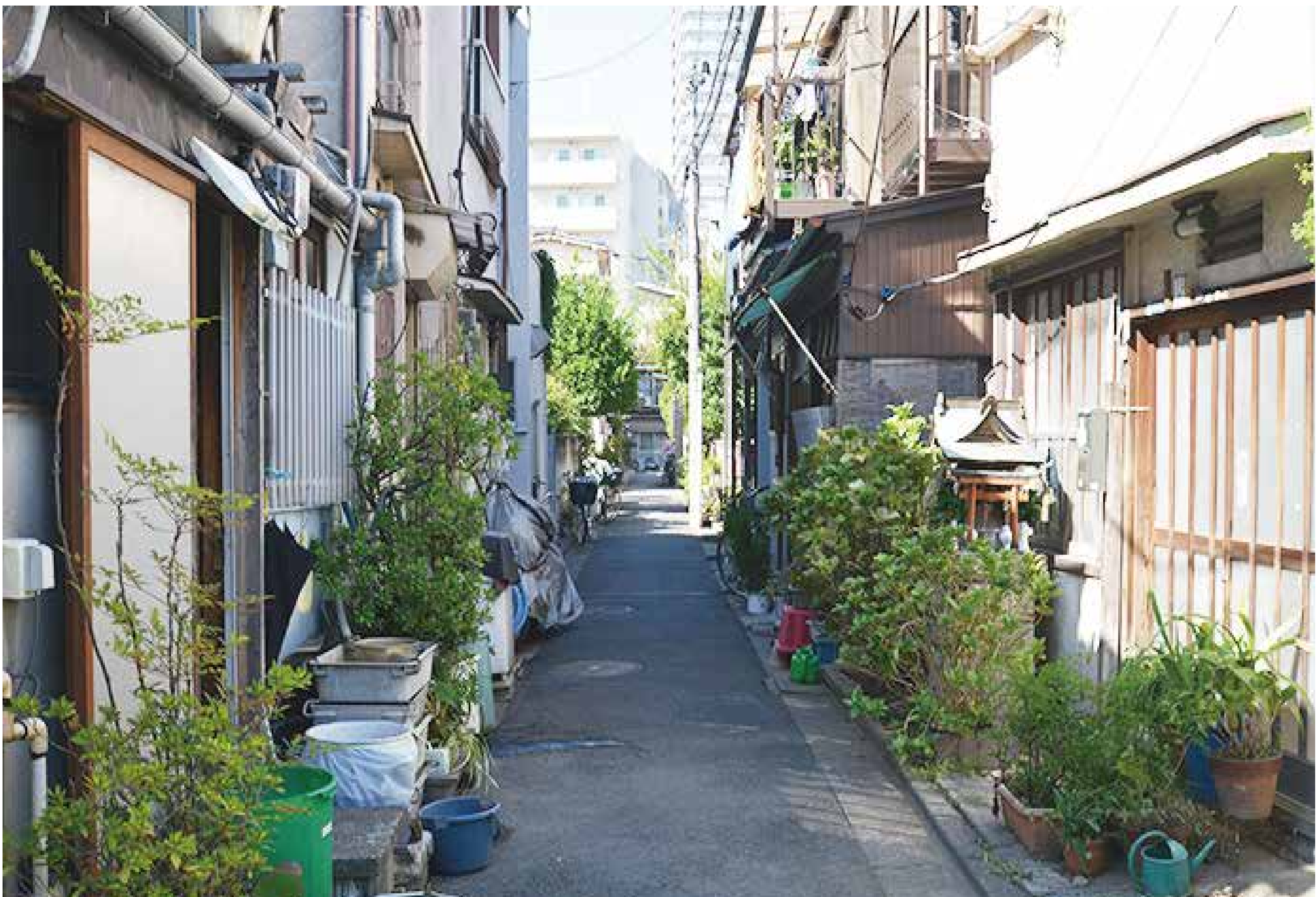
Alley space in Mukojima