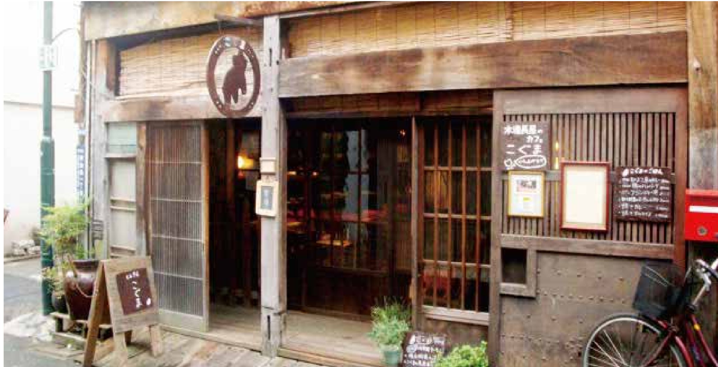
The appearance of the Koguma Cafe

Increase of vacant houses in the dense wooden area can lower the security, by arson or illegal dumping. So, vacant houses that are found to be dangerous would be removed, in cooperation with the local government. On the other hand, there are movements to utilize the vacant houses and stores. The old house in the shopping street built about 90 years ago is now used as mix of residential and "Koguma (Little Bear) Cafe".