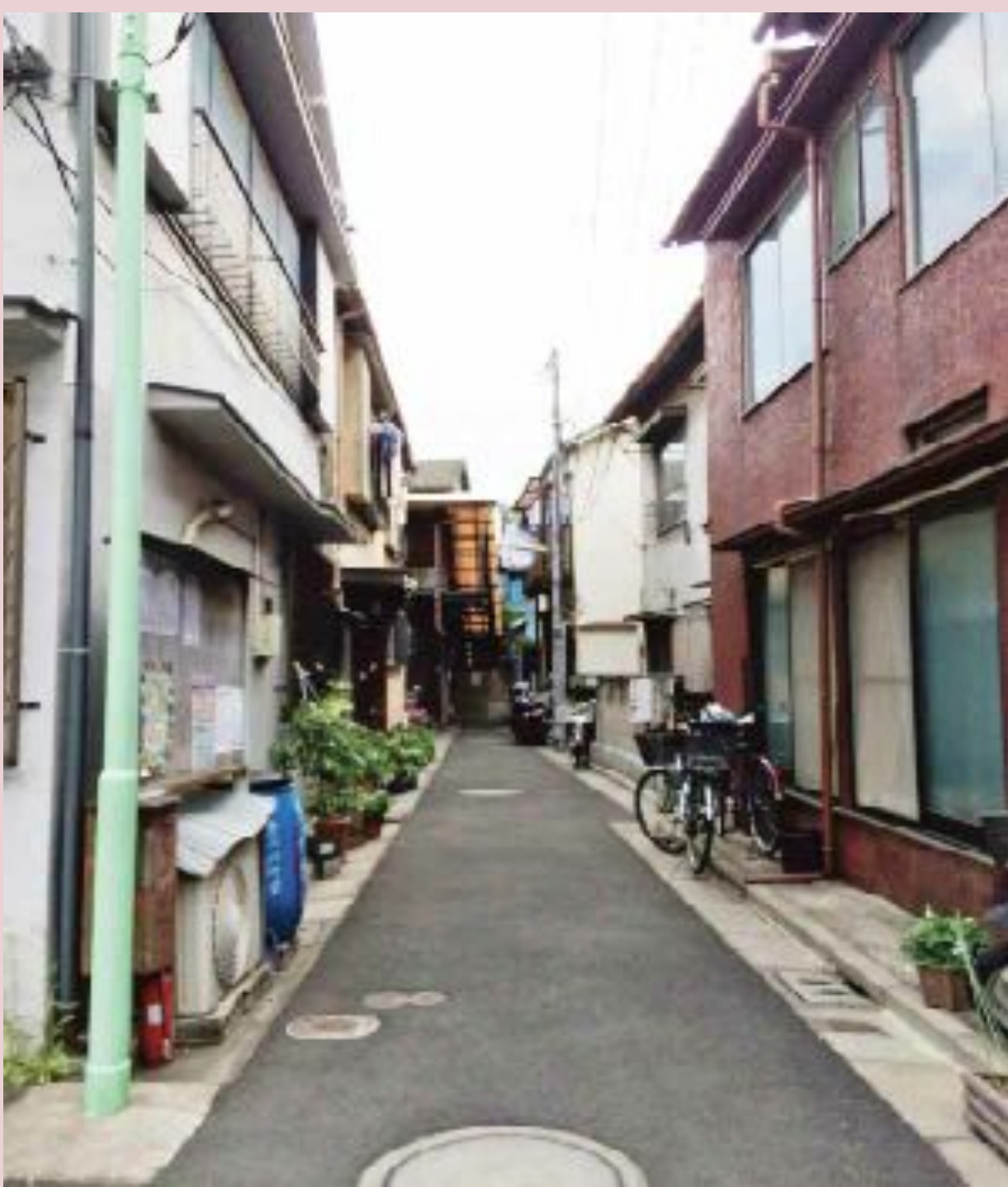
The dead ends