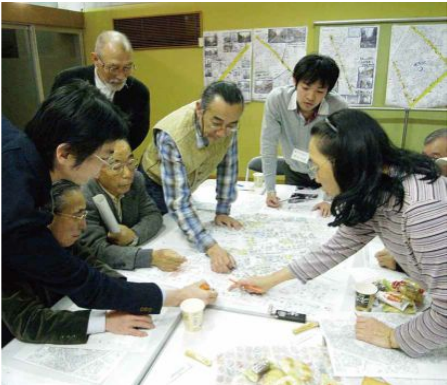
The residents did research and made a draft plan for the high density targeted area, to propose an authorized city plan.