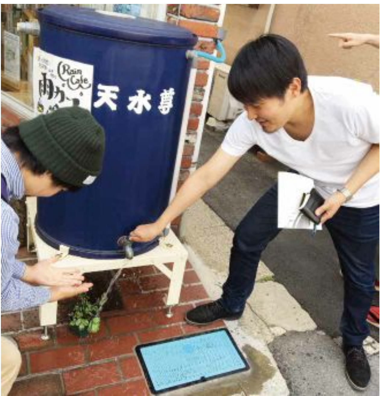
Through “Rojison” and “Tensuison”, they thought about the significance and the need of rainwater utilization.