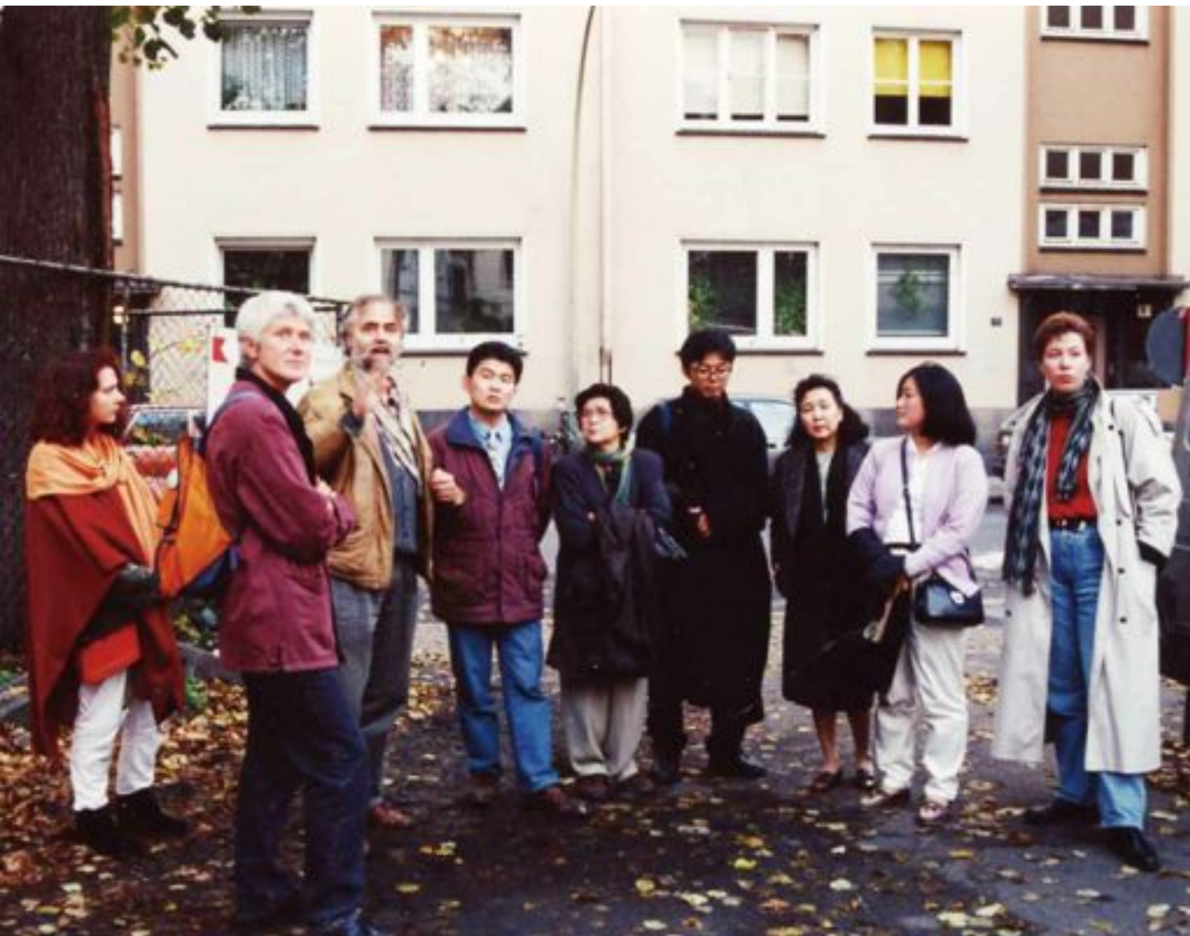
25 years ago, a visit to Ottenzen from Mukojima. International exchange has been carried out mainly in Germany.