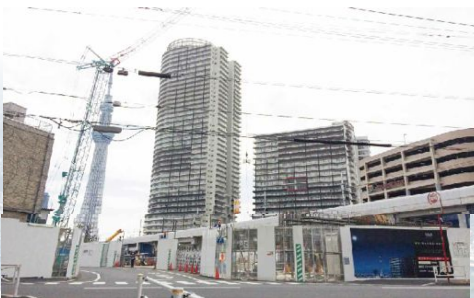
Large scale redevelopment taking over local community

However, wooden and dense housing area faces the problems with security and seismic improvement measures. In addition, to create a safe, comfortable society where the elderly or children can live, the strengthening of community and utilization of local resources are needed.