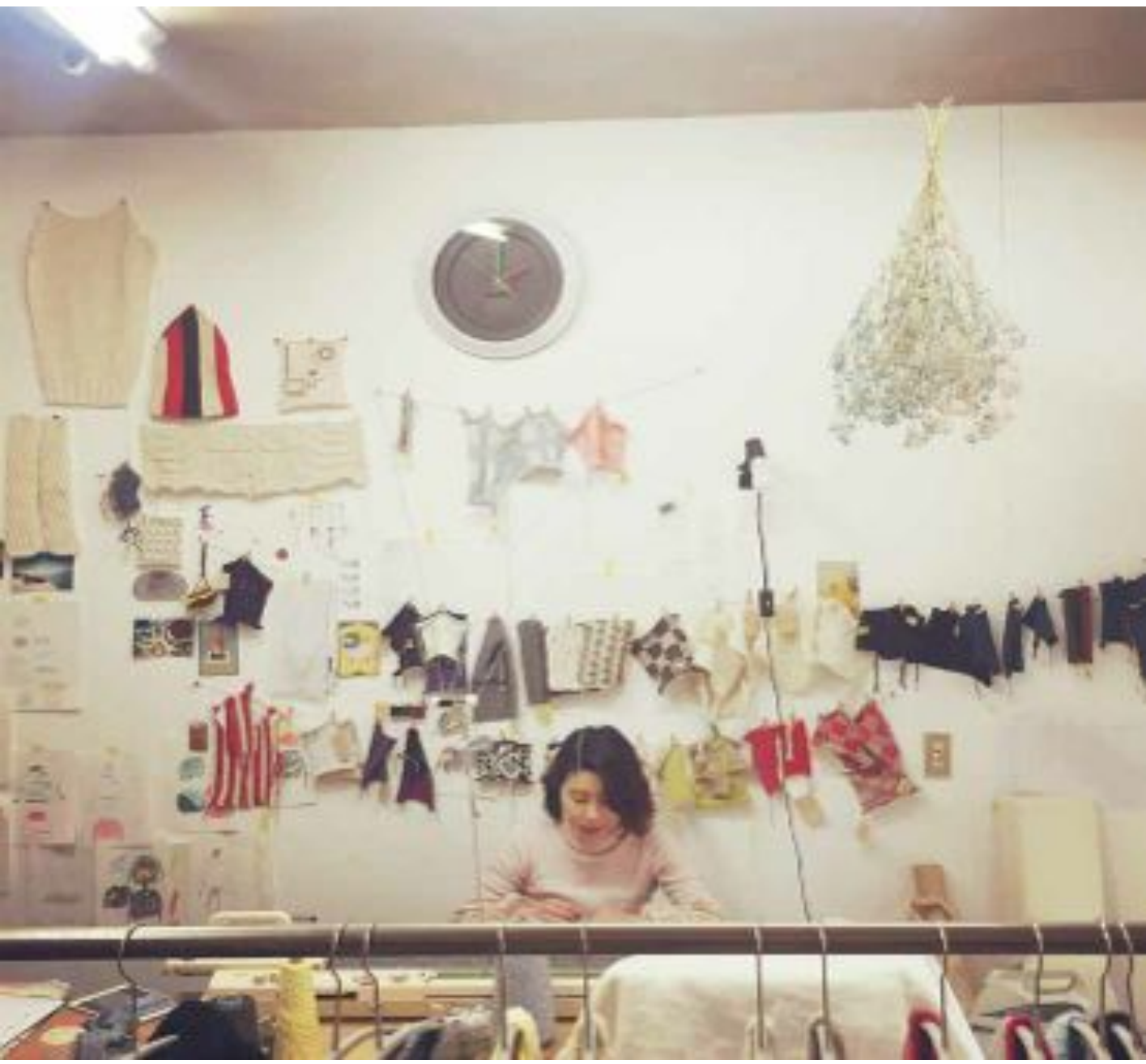
By having artists move in, vacant houses or spaces can be utilized.