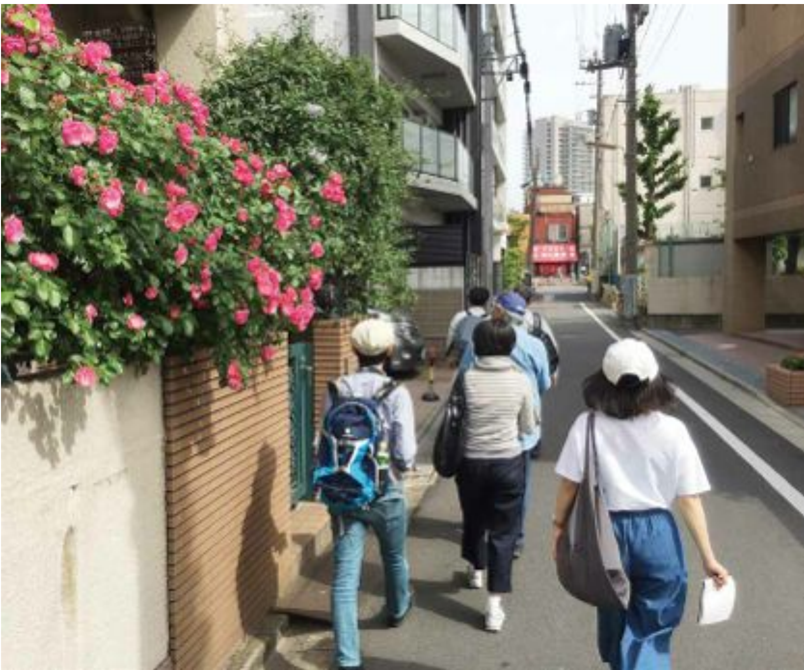
With the Mukojima Jane's Walk, people rediscovered the attractiveness of the walkable community.