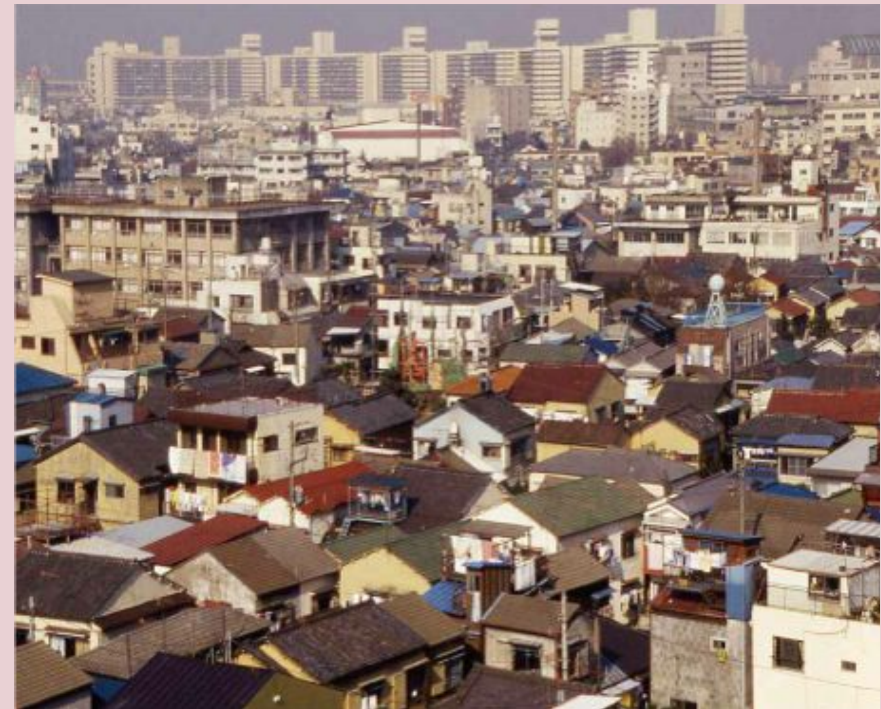
High density wooden houses area