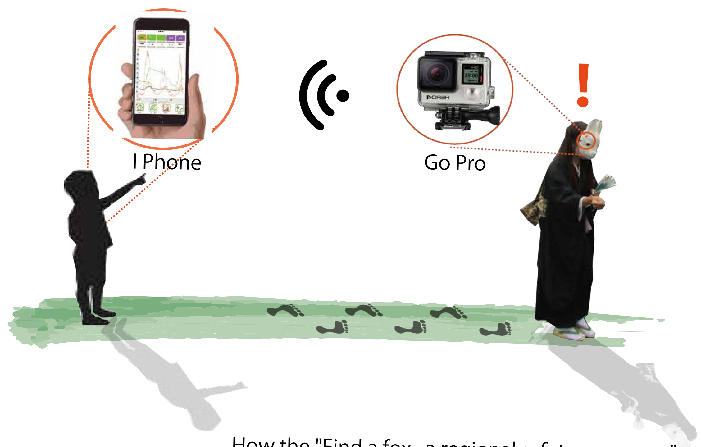
How the "Find a fox , a regional safety program ."

Fusion of disaster prevention and art , involving the community