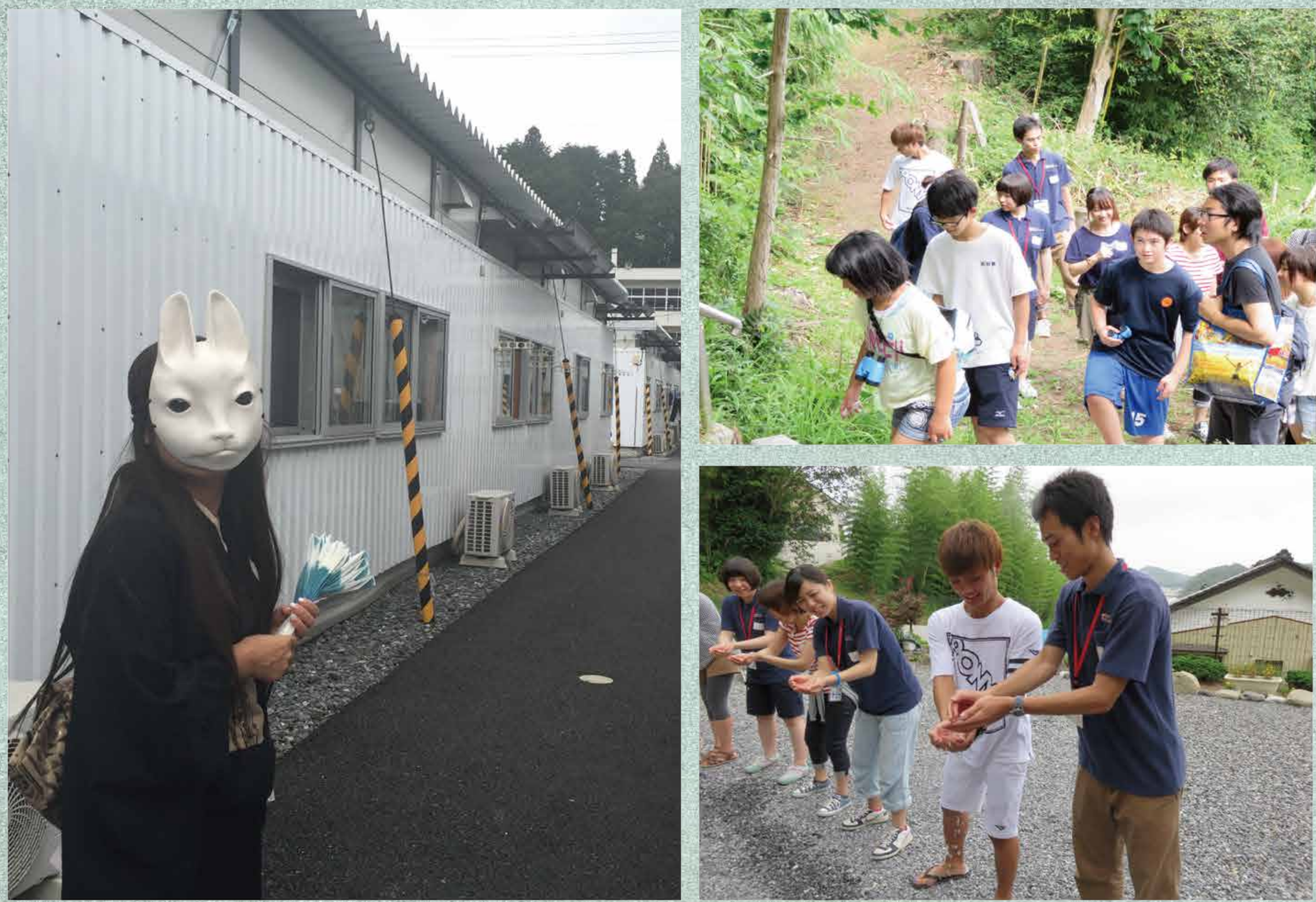
Participants walk on the evacuations route chasing the character of the fox

⇒ Looking for the fox and explore the city .