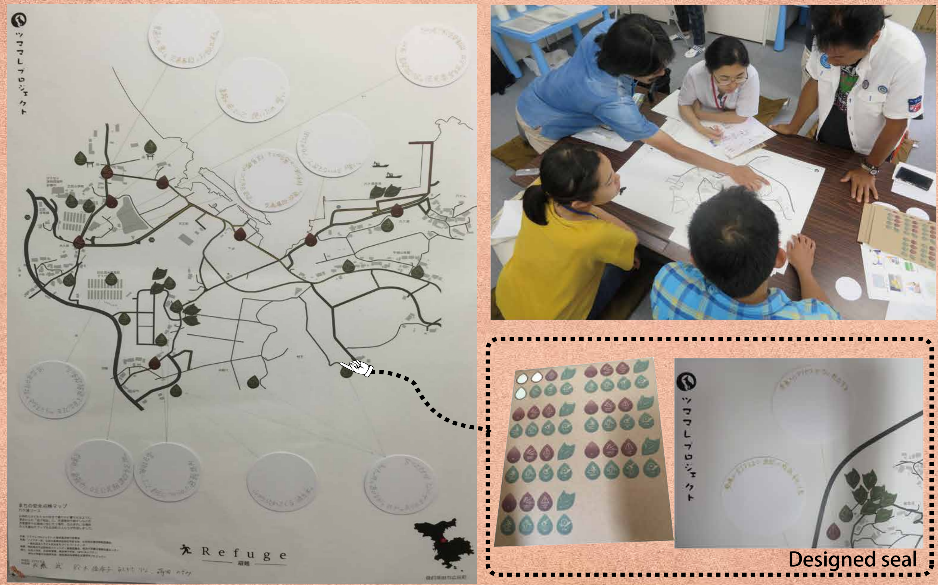
Safety map making ,adding your information