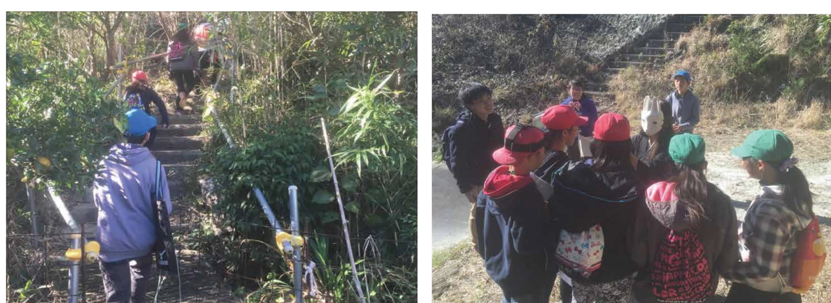
Children who for the field work

In a elementary school in Shimoda Shizuoka Prefecture , they carried out a program using the technique of " Find a Fox " . In carrying out the field work in the community , the the character of the fox appears in the emergency shelter . In addition, the character of fox distributed the whistles for the emergency to the students . The motivation of the disaster preparation and prevention was significantly improved.