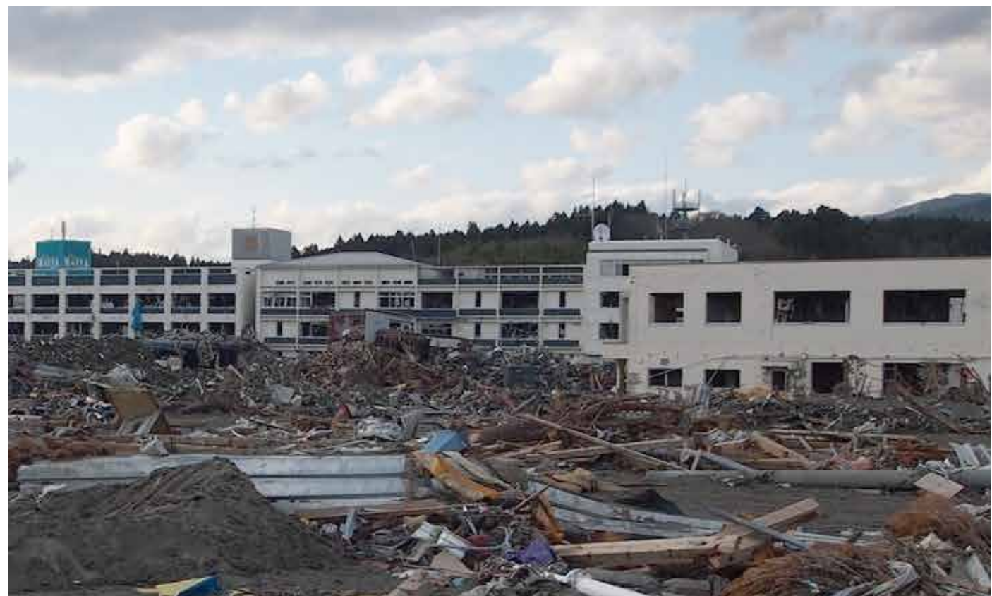
2011 Still filled with all rubble