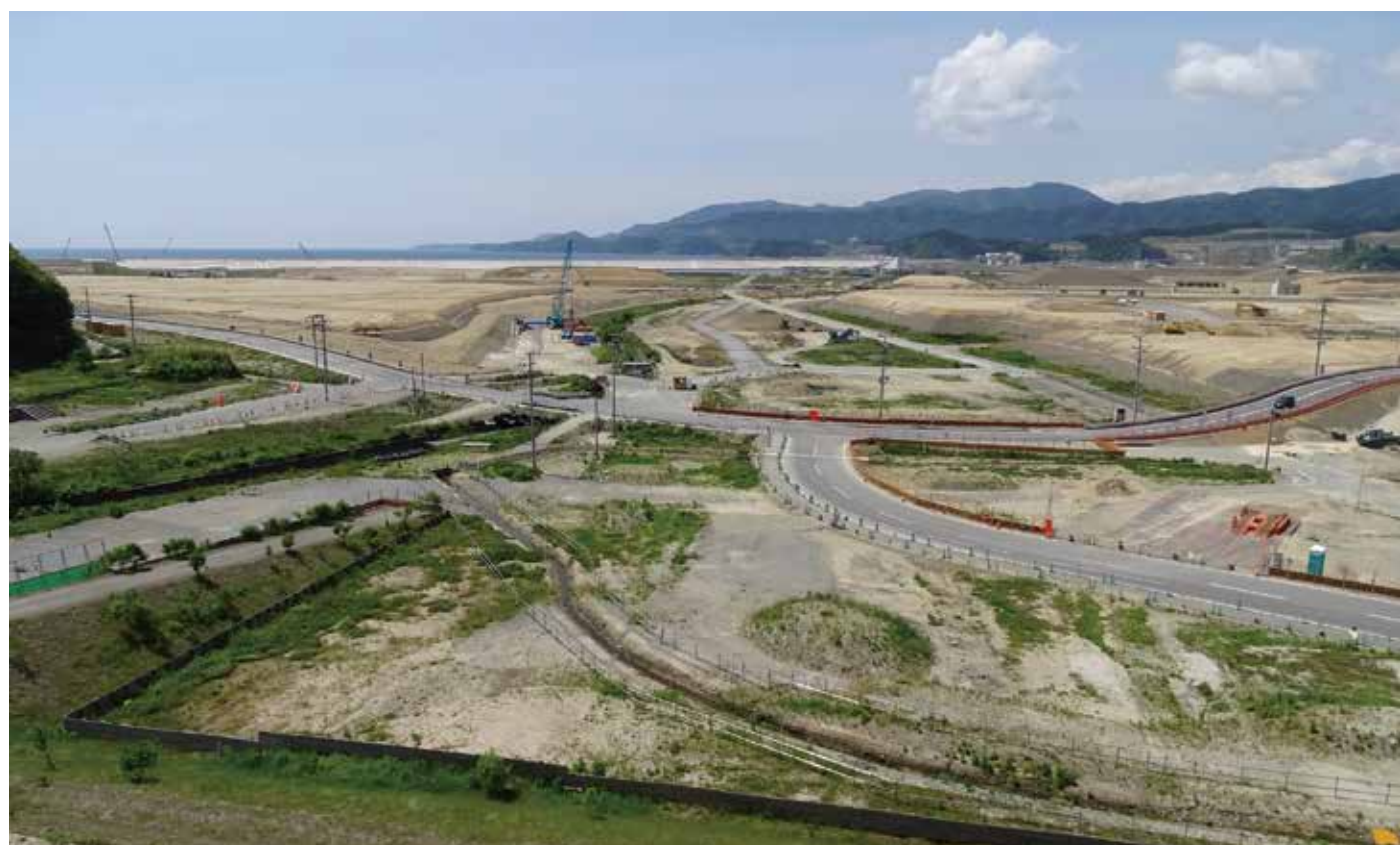
2016 Sand transportation finished, landfill construction continues