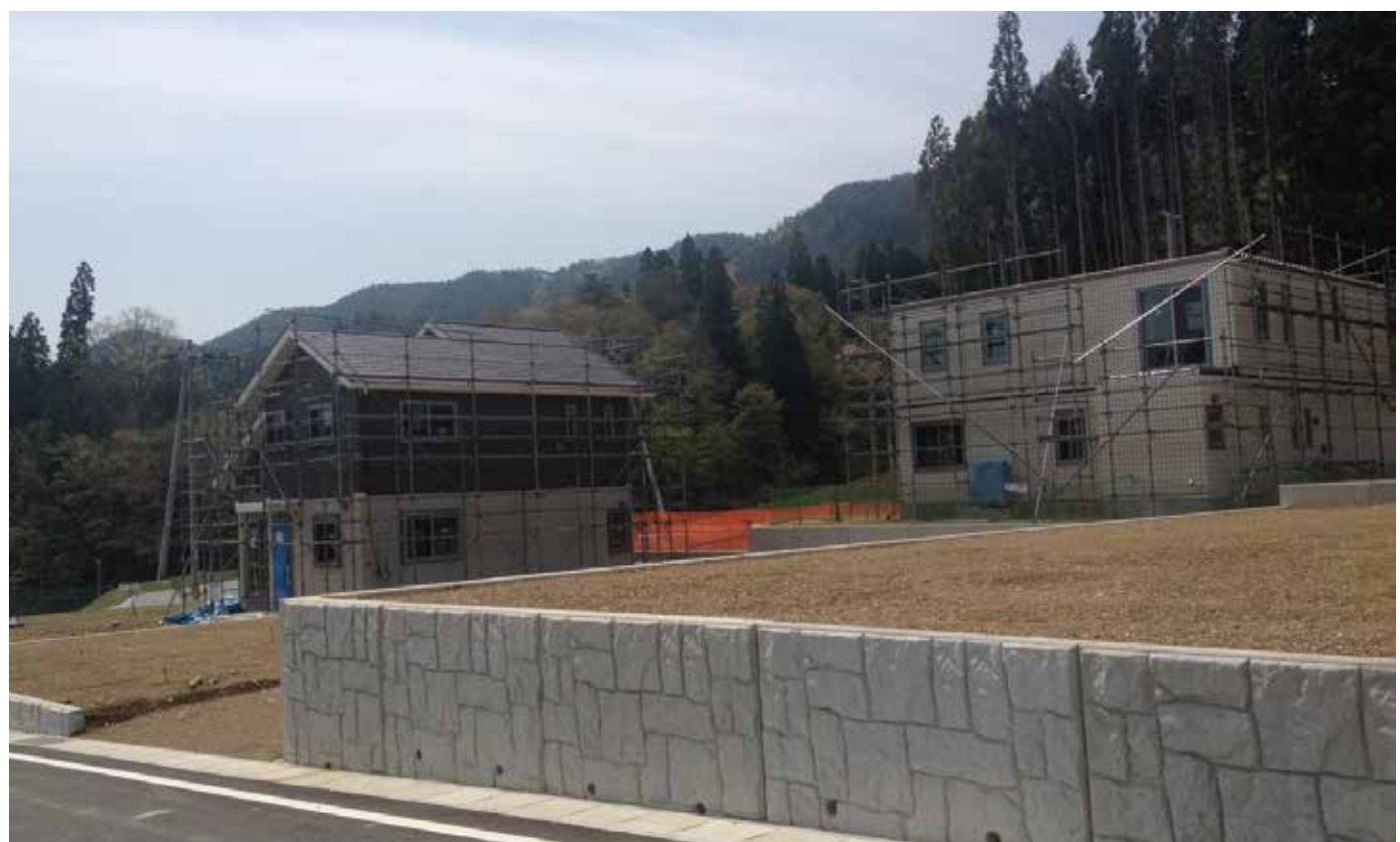
2015 Construction of housing on upland