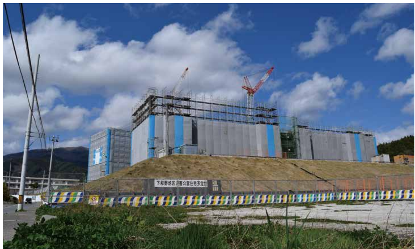
2014 Construction of public housing