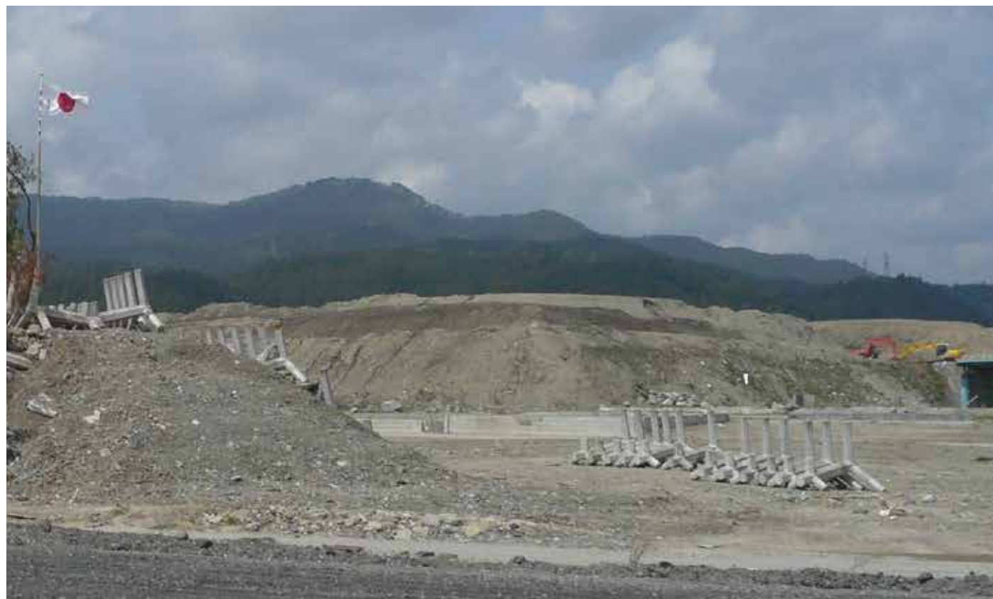
2013 Landfill construction began