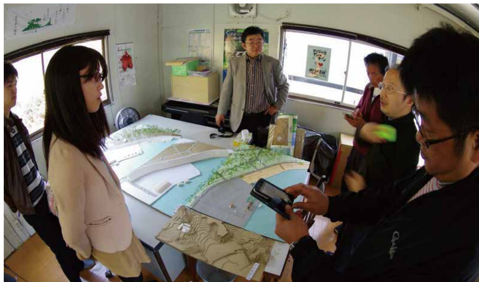
Geographic model to study on seawall

Our laboratory keep visiting Rikuzen-Takata and support their restoration activities. For example, making geographic models and reproduced housing models to support their discussion, and doing research on residents' perspective of temporary housing.