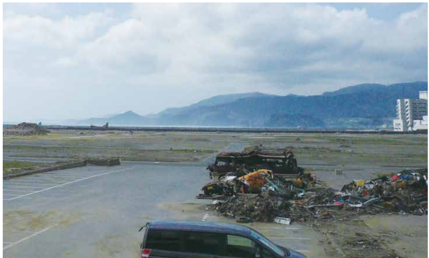
2012 Rubble removal progressed