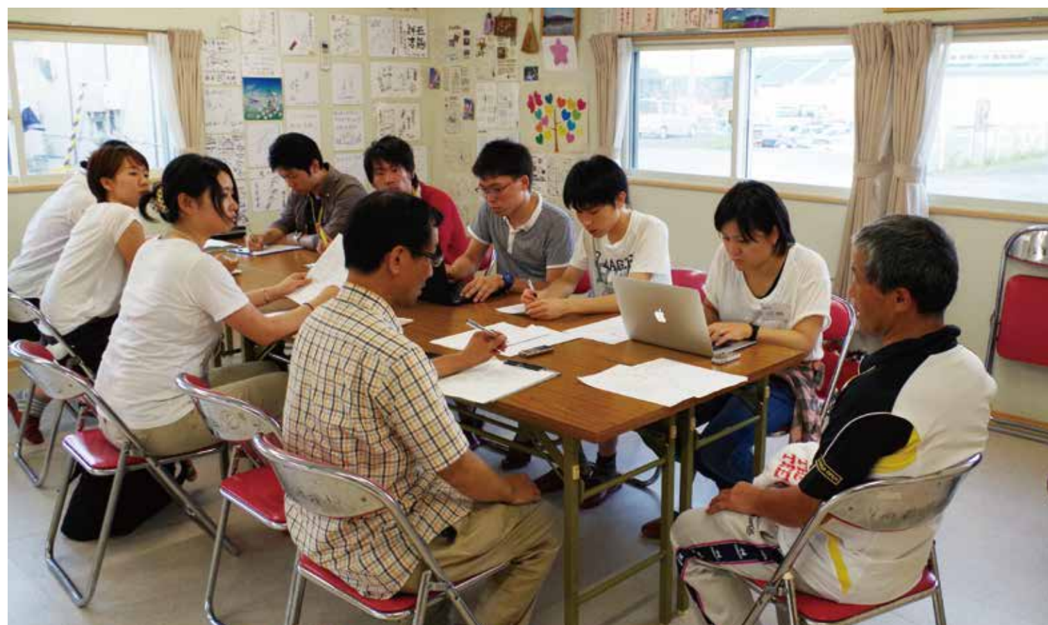
Research of temporary housing