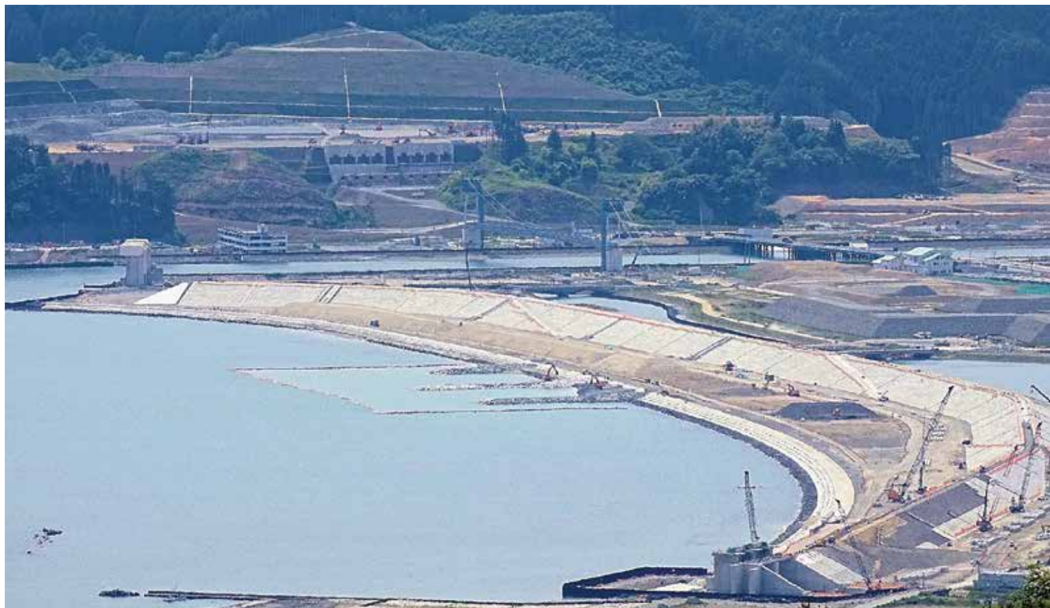
Construction of high seawall and Landfill

It's been five years since the earthquake. It may seem that revitalization activities are making good progress. However, there are problems have become more serious as time passed by.