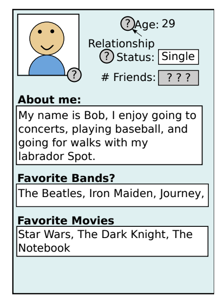
Figure 1: An example profile shown to users in our study.

(11/20) responded that they "simply refuse to post this information" and that no technical measure could change their minds. In the interviews, participants also revealed that certain information, such as address and/or phone number, was simply too private to be entrusted to Facebook. Overall, our analysis clearly showed that concerns about information disclosure were actually less relevant to users than the issue of veracity of information contained in profiles. Interestingly, all participants agreed that a Facebook profile contained enough information to make a decision about whether to date someone. This suggested that Facebook would be an ideal source of information to bootstrap trust in ODS.