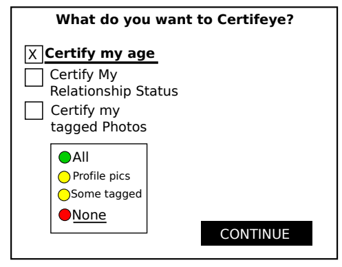
Figure 3: The main Certifeye interface

Finally, after consenting to the syncing of her Facebook account with her ODS profile, the user is presented with the main Certifeye interface, where (s)he can choose to certify relationship status, age, and/or photos (Figure 3). Observe that we embed trust in our design by envisioning periodic user interaction to "renew" the certification. After a user has gone through the Certifeye interface once, badges are not updated when her Facebook information changes. Therefore, after a set period of time, the badges revert to grey question marks. The Facebook API would actually grants ongoing access to a